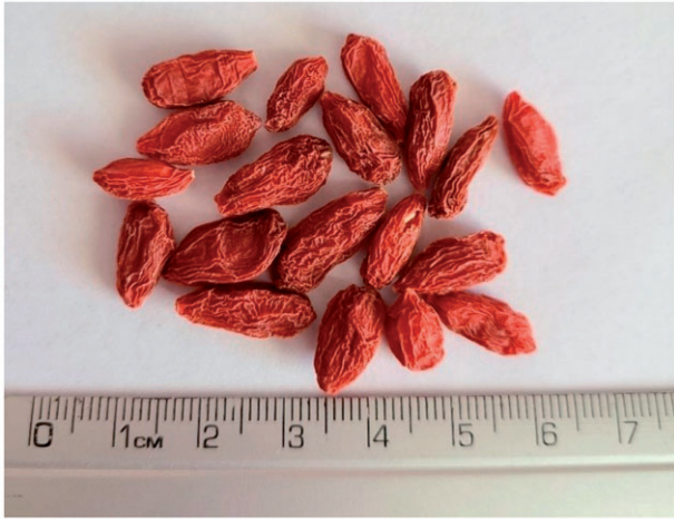
Figure 1 Dried goji berries.