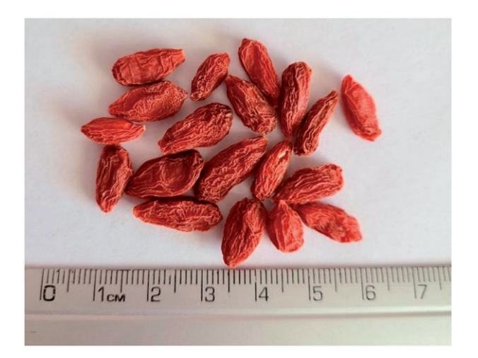
Figure 1 Dried goji berries.