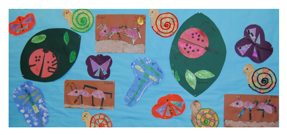
Figure 1. Insects and Flowers

Kindergarten students identified characteristics of complex flowers and insects by creating illustrations using patterned geometric shapes.