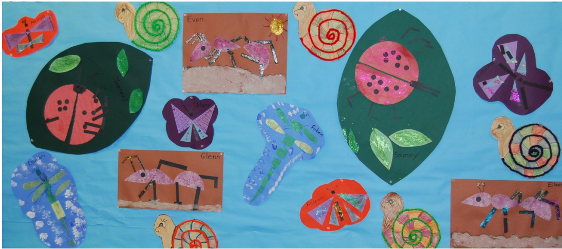
Figure 1. Insects and Flowers

Kindergarten students identified characteristics of complex flowers and insects by creating illustrations using patterned geometric shapes.