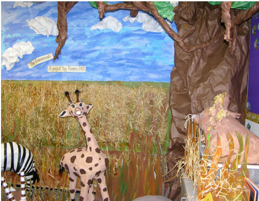
Figure 2. African Savannah

While learning about animal habitats, second grade students installed a mixed-media depiction of the African Savannah.