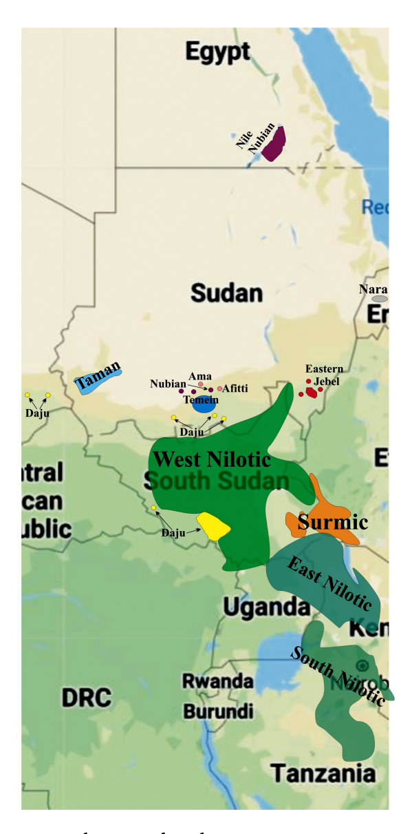
Map 1. The East Sudanic languages

The nine branches remain the accepted listing with some relatively minor reassignments. There have been few attempts to synthesise data on East Sudanic, the unpublished MSc thesis of Ross, <sup>11</sup> who was a student of Bender, and Bender's own studies and monograph. <sup>12</sup> The study by Starostin of Nubian–Nara–Tama is part of a project to re-evaluate East Sudanic as a whole from the point of view of