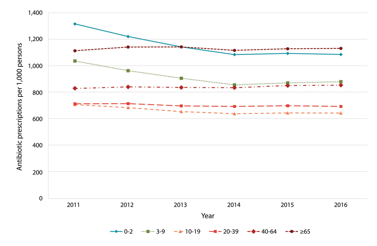
King et al.