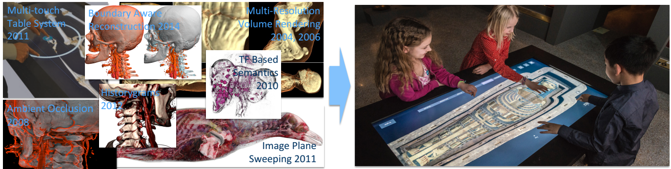
Figure 1: The visualization table developed at the Norrköping Visualization Center C, Linköping University, Sweden, is based on a progression of visualization papers over the past decade 2-9 (left hand side), integrated into an application that has impact both in the medical domain and is used in science communication. The image on the right hand side shows visitors to the Mediterranean Museum in Stockholm interacting with a combined surface and volumetric visualization of the mummy Neswaii. A fuller account of this project has recently been published as a contributed article in the Communications of the ACM. 10 Papers of this kind provide valuable success stories to the visualization community showing how to combine and tailor the contributions of many technical VIS papers into a widely used system.

Integrating visualization techniques into a system—including work with application professionals, the combination and refinement of individual methods and detail work to create usable systems—requires large teams with dedicated researchers working at the interface between visualization and application. These researchers bridge the gap between fundamental visualization technology research and the grander vision of data understanding. Application papers document these efforts, providing valuable knowledge to peers on how to build these large scale systems. Furthermore, researchers at the interface between visualization and application science—who invest an immense effort in infrastructure-building and integration—need a clear career path, and in the traditional evaluation model this requires publications. Application-oriented papers are important for these researchers to earn recognition and to prosper in their careers. The success of these researchers in turn supports the field, demonstrating that innovation in newly developed methods can be used and will have an impact on real-world applications.