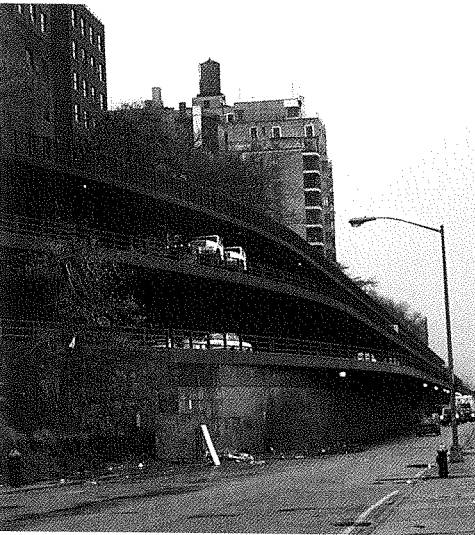
Traffic on the Brooklyn-Queens Expressway ducks onto two decks cantilevered from a cliff and covered by the Brooklyn Heights Promenade. When engineers proposed the freeway structure, Moses added the promenade.