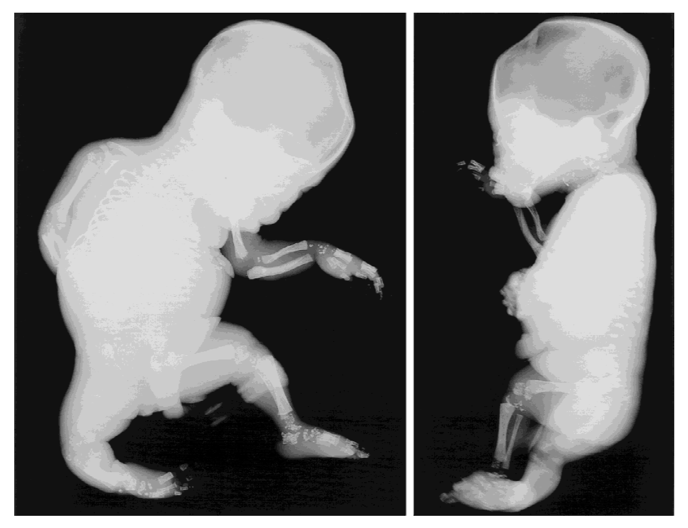
Fig. 4. AP and lateral radiographs of patient 5. Note the limb length asymmetry and stippling of the spine, rib ends, pelvis, limbs, carpals, tarsals, and larynx.

tase E (ASE) localized to Xp22.1 [Daniele et al., 1998; Franco et al., 1995]. Although our patients were not tested for ASE deficiency, none had the distal phalangeal hypoplasia characteristic of CDPX1.