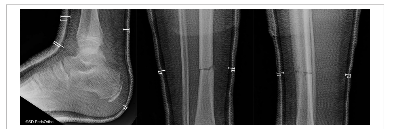
Fig. I. Sagittal and anteroposterior views demonstrating the measurements taken on the radiographs which include front of cast, back of cast, and cast mold at the fracture site.