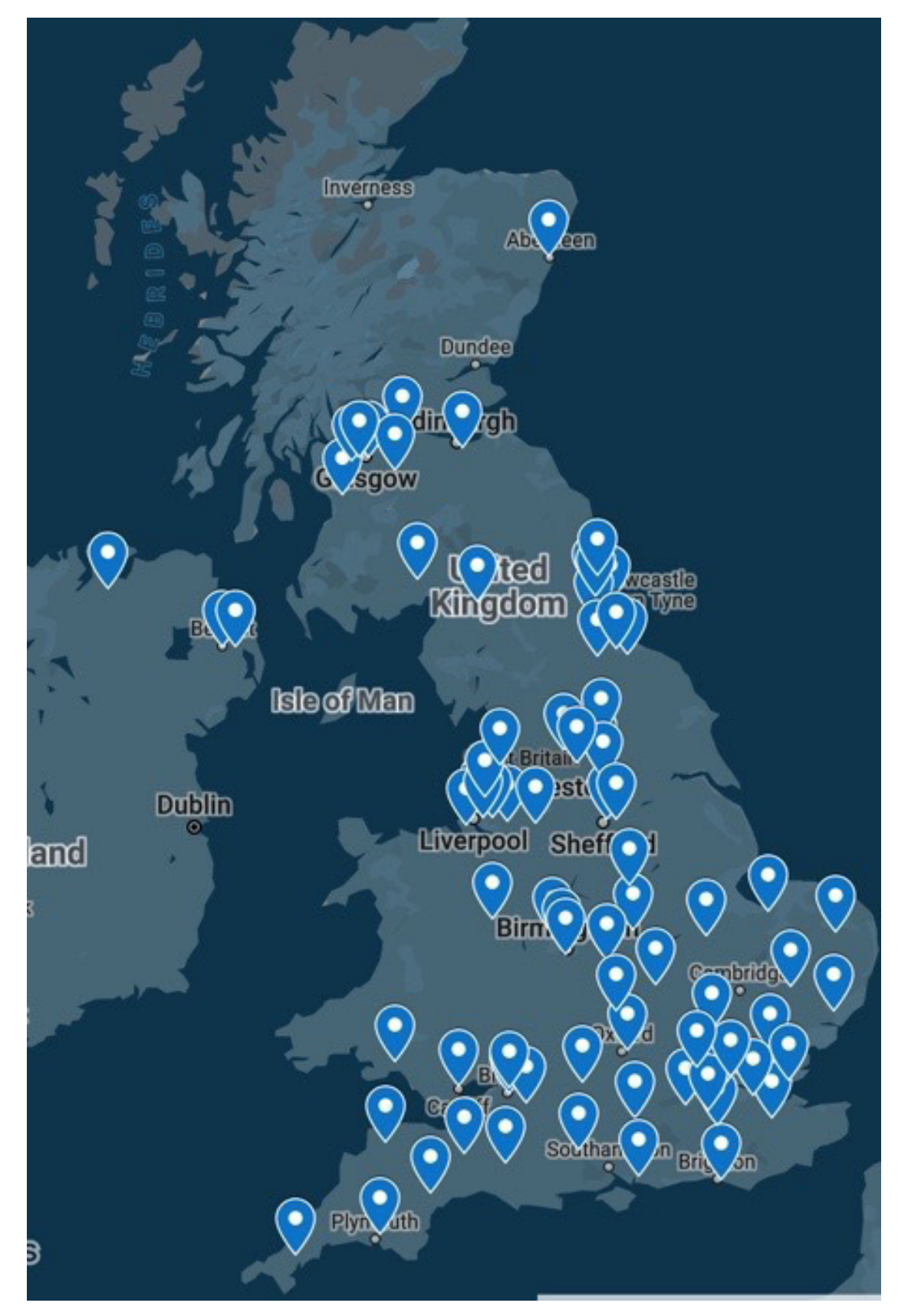
Fig. 1 Distribution of enrolled sites.