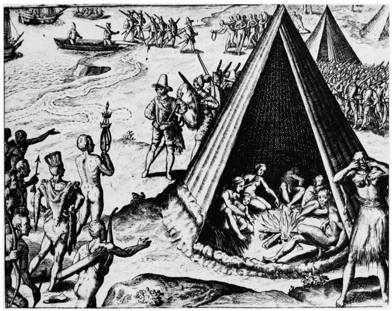
Fig. 1. Indians welcome Francis Drake to California in 1579—an engraving from a book by Théodor deBry (Historia Americae), published in Frankfurt in 1599. This was the first published picture of California Indians.

herein), five of them essentially from the seventeenth century and two from the midnineteenth century. The following comments on each of the drawings indicate the difficulties of establishing what may have happened to the drawing between the time of the actual event depicted and its later appearance in a printed publication. Even the late sixteenth-century artist or engraver of the first of the Francis Drake series presented here (earliest drawing dated 1599, 19 years after the world-encompassing voyage) may be accused of eclecticism or compositeness. While the later illustrations of crowning episodes in the voyages of Schouten and Lemaire, published