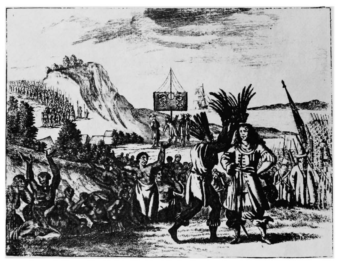
Fig. 4. Francis Drake being crowned by California Indians, from A. Montanus ( De Nieuwe en Onbekonde Weereld... ), Amsterdam, 1671. The right side of the banner has been identified as presenting the coat of arms of the city of Plymouth, England, the port from which Drake set sail in 1577 and to which he returned three years later, after having circumnavigated the globe. Note that the presumed figure of Drake is shown here without a beard.

representation of the "Drake's Plate," mounted on a post. Its great size compared to the metal plate usually referred to as the original one, now in the Bancroft Library of the University of California, may be explained in this drawing as artistic necessity. One of the glaring inconsistencies of the picture is that there are shown four apparently good-sized ships, some under heavy sail, in the bay, with the wind apparently coming from two directions. It has already been mentioned (see comments for Fig. 1) that Drake had, at most, two ships during this part of his voyage.