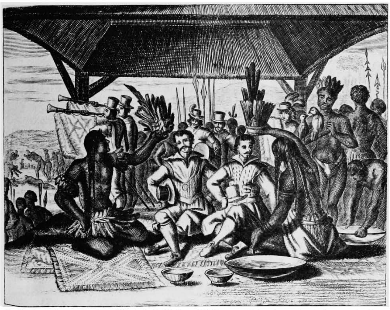
Fig. 5. Two leaders of a Dutch expedition in the Pacific Ocean, W. Schouten and J. Lemaire, are shown being crowned on Hoorn (Futuna) Island, in western Polynesia, ca. 1616 (Montanus 1671). Note resemblance of feather headdresses to those of California.

The group of houses here may be parts of a fort, mentioned in the earlier accounts, but where is the surrounding wall? It is also unlikely that these houses were completed so soon after the arrival of the ship in the bay; surely the nature of the scene itself implies landing only a few days or even hours before the ceremony. On the other hand, the houses almost certainly cannot be interpreted as Indian structures.