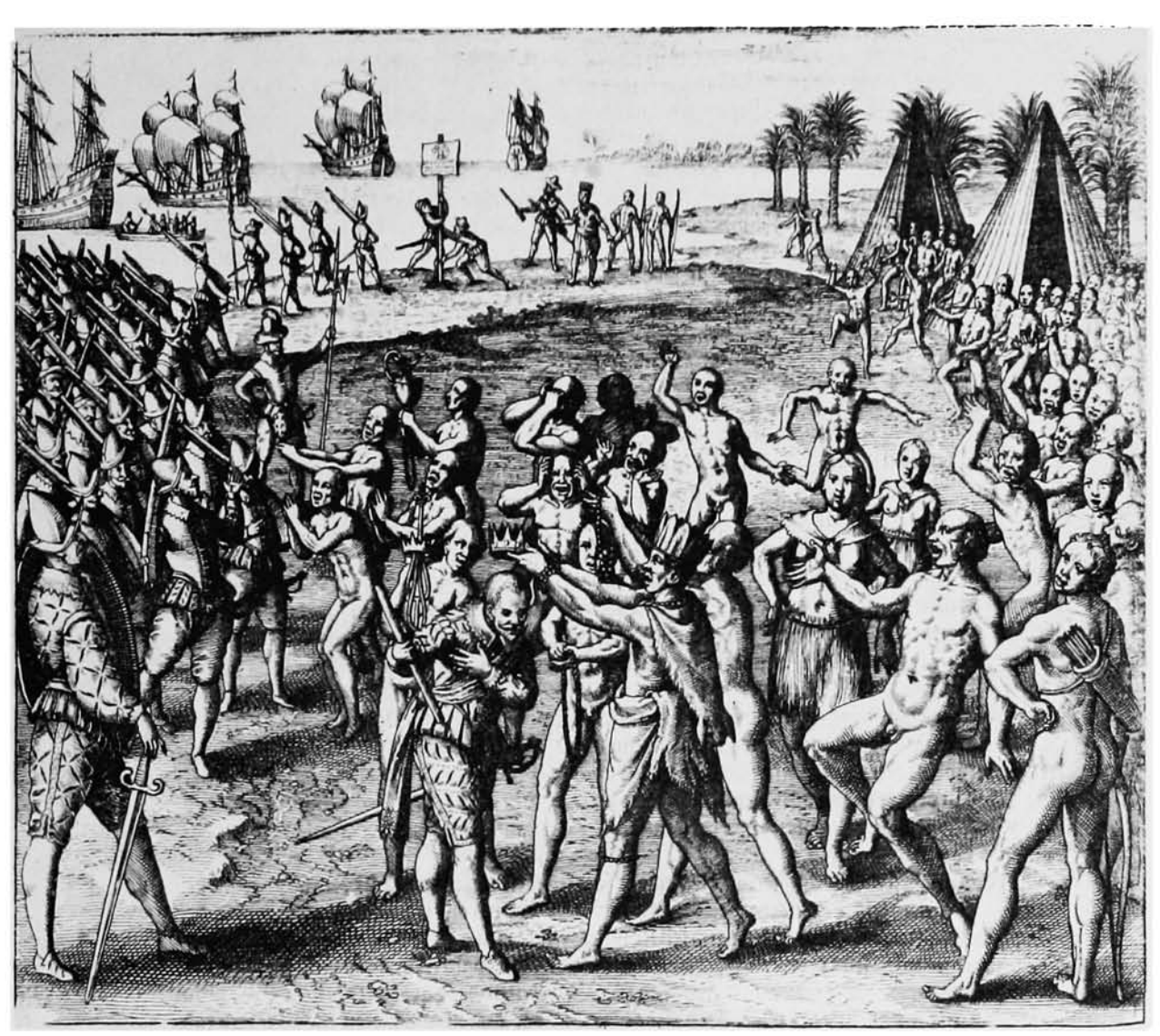
Fig. 3. Another engraving from J. L. Gottfried (Newe Welt...), 1655, showing crowning of Francis Drake in California. Note similarity of house types to those shown in drBry (1599) engraving (see Fig. 1), and possible depiction of "Drake's Plate" on post.

Sir Walter Raleigh's "crowning" in Guiana in 1595. Note the native chief's feather headdress, like those shown for California (cf. Fig. 3, taken from the same volume, i.e., Gottfried 1655). One of Raleigh's officers, presumably, is shown smoking what appears to be a cigar; the fruit offerings by the natives certainly could represent tropical species. However, the coastline depiction is not strikingly reminiscent of the tropical forest land near the mouth of the Orinoco River, but happens to