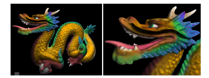
Figure 1: Our interactive 3D paint application stores paint in an octree-like structure with an effective resolution of 2048<sup>3</sup> (using 15 MB of GPU memory). Our system paints and renders this 817k polygon model with an octree texture at 15–20 fps and supports quadlinear filtering.

We unify memory usage for adaptive paint resolutions and mipmapping. The page table hierarchy allows us to share physical tiles between mip levels when the adaptive resolution is coarser than or equal to the mip level's resolution. This is non-trivial for two reasons. First, since we are using a "node-centered" scheme, as opposed to traditional "cell-centered" textures, the filter support is different (see Figure 2R). Second, since we are allocating texels in blocks, many texture samples do not intersect the surface and thus will never be assigned colors. It is important that these samples do not contribute to the filtering used for coarsening. Thus we identify "valid" texels by recording the resolution level at which each texel has been written into the alpha channel. This allows us to refine from low resolutions to higher resolutions while still identifying which samples were actually painted at a specific resolution.