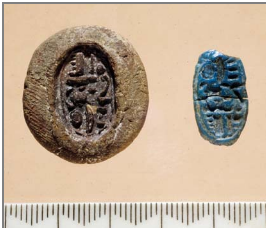
Figure 2. Clay mold (left) for making a faience ring bezel (right). Note that the hieroglyphs are less clear on the bezel than in the mold. This is a common problem in faience manufacture.

sufficient to facilitate throwing. Wheel throwing has been argued for the Ptolemaic and Roman periods in particular, when clay may have been included in the faience body, but there has been no agreement about whether the wheel was actually used.