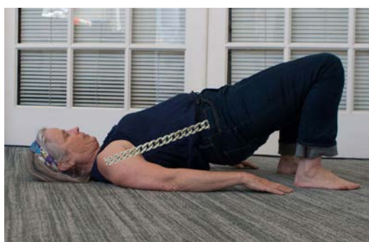
Figure 4. ‘Spine like a chain’ (illustration picture with superimposed image of a chain).

A common problem in human movement is how to enhance the efficient, comfortable, and safe use of the spine. This is not just a question of anatomy and physiology alone, as human movement is learned from infancy in the context of the community’s “form of life” for the individual (e.g., task demands, socio-cultural practices, the material-cultural environment; Rietveld & Kiverstein, 2014, p. 327). The most efficient movement of the spine involves the distribution of force and movement through the spine according to its overall shape, the structure of the vertebrae, and their relationships.