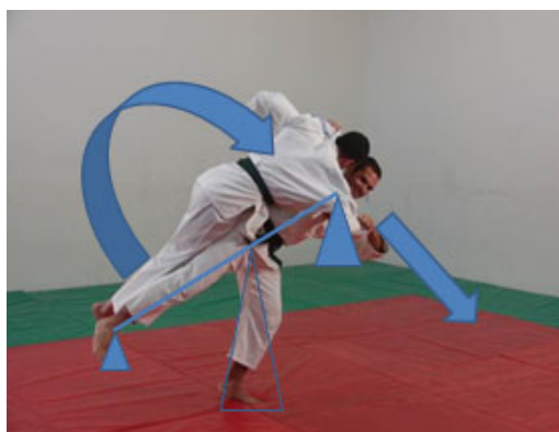
Figure 2. Instructional use of the “balance beam scale” metaphor in judo (sport)

Figure 2 shows a male judoka performing Harai Goshi. The judoka is leaning his torso forward so as to counter-lever the other end of the embodied beam that sweeps up the opponent toward horizontal orientation, at which point he will rotate and fling the opponent over and onto the ground. As such, a judo sensei is likely to offer a judoka who is practicing Harai Goshi the metaphorical transition information, “Add weight to tip the balance beam out of balance” (Sánchez-García & González, 2014). If he accepts this augmented information, the judoka projects it onto his systemic field of action, which includes the opponent, as a new environmental constraint that he must comply with in order to complete the task of overthrowing the opponent. Initially, this new metaphorical image may disequilibrate and unpack the judoka’s (ineffective) motor action coordination. With practice, though, he may figure out a new coordination that engages this image as an affordance for solving the problem. Reaching expertise, the judoka need no longer invoke the image, because the coordination becomes for him second nature. Unless he coaches others with the same image, he might forget it completely.