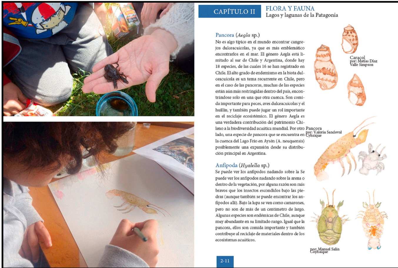
Fig. C1. 2016 Workshops on scientific illustration, with field observations (upper left) and classroom activities (lower left) contributing to a field guide and educational material on local lake.