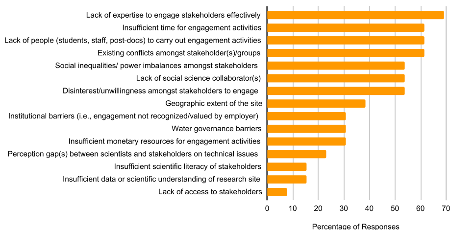
Fig. 3. Barriers to stakeholder engagement identified by SAFER researchers.