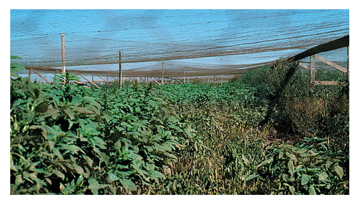
Figure 10. Flight pen with a dense cover crop of volunteer plants.