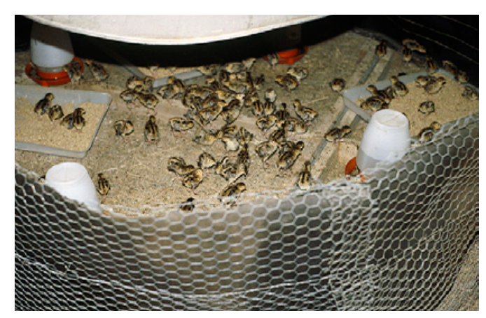
Figure 4. Cool-room, floor brooding with a radiant propane brooder.