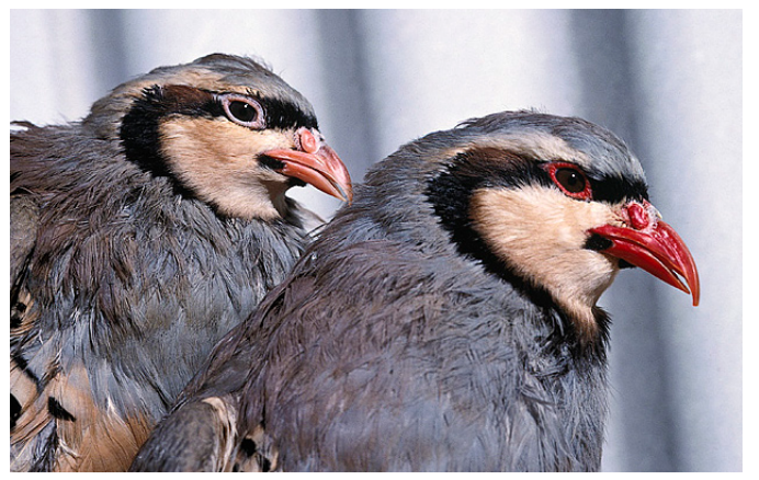
Figure 17. Comparison of sexually mature female ( left ) and male ( right ) chukars.

Following are recommendations for the proper care of hatching eggs: