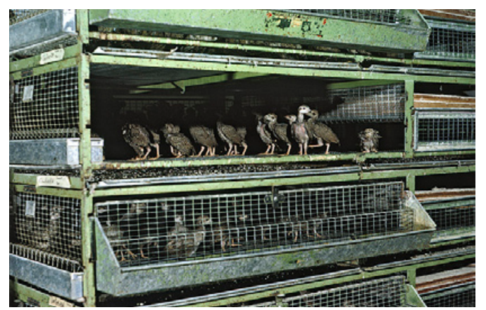
Figure 6. Battery brooding chukar partridge chicks.

wet litter in the pen, ventilation is marginal or inadequate. Fans and uniform-slot air intakes provide good ventilation in a house with high bird density. Ventilation should be designed to mix colder incoming with warmer inside air before it reaches the chicks' level.