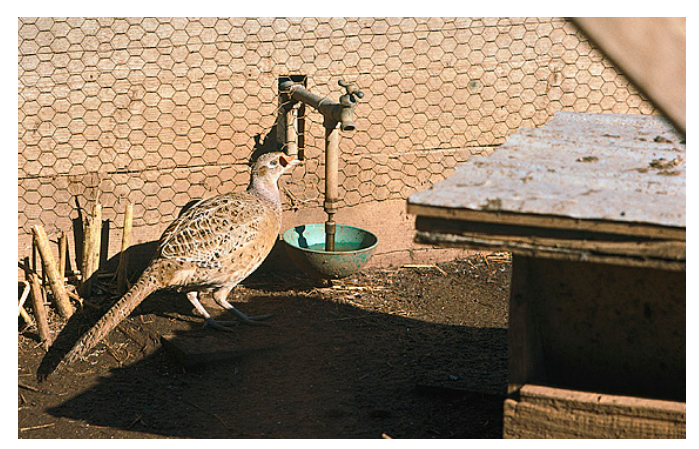
Figure 14. Pheasant nest box with metal roof for use in an outdoor breeder pen.

suring 2 feet (0.6 m) wide by 6 feet (1.8 m) long by 1\frac{1}{2} feet (0.45 m) high.