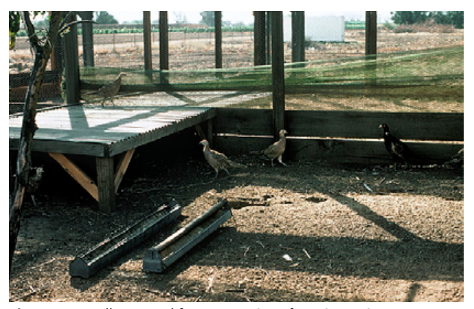
Figure 9. Small pen used for propagation of exotic species.