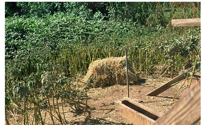
Figure 19. Bale of hay used in flight pen to provide birds with something to do, and thus deter picking and cannibalism of pen mates.

trimmers used for chickens work equally well for game birds. Heavy nail clippers can also be used to trim the bill.