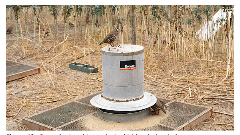
Figure 13. Range feeder with metal rain shield and wire platform.