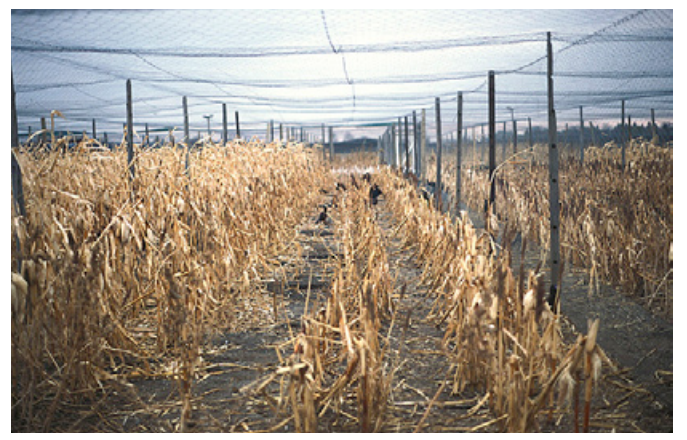
Figure 11. Flight pen with a good cover crop of field corn.

The space requirements for growing ornamental pheasants are greater than for other pheasants on account of their timid behavior and elaborate feathering (fig. 9). More protection is usually provided for exotic pheasants such as fireback, argus, peacock, and longtailed pheasants.