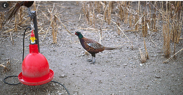
Figure 12. Three types of water fountain used in flight pens.