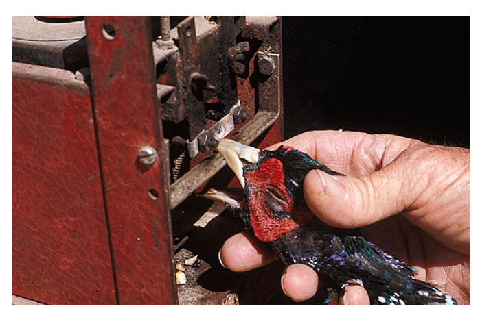
Figure 21. Beak trimming with an electric trimmer.