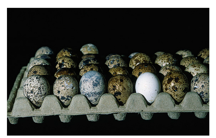
Figure 16. Clean Japanese quail eggs stored in an appropriate-sized egg flat.