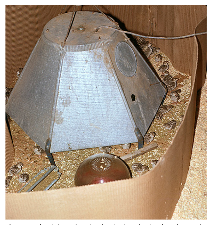
Figure 5. Electric hover brooder showing brooder ring, brooder guard, and equipment.

An equipment washing area should be provided near the hatcher(s). A reasonable arrangement for a small hatchery would be as follows: