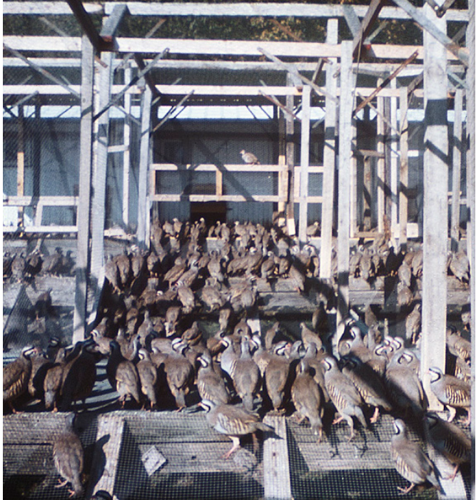
Figure 7. Two types of wire-floor pens used for quail and partridge.

Always check young chicks after dark (with the lights off) to be certain that none are huddled away from the heat. Chicks that settle away from the heat will become chilled and those on the outside of the huddle will crowd toward the center, causing chicks in the center of the group to smother before morning. Move any that are huddle away from the heat back under the brooder. An attraction light under the stove can help keep chicks under the stove at night.