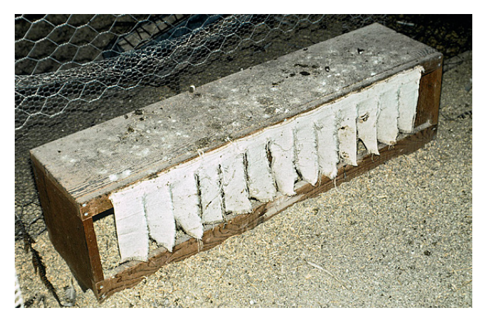
Figure 15. Community nest box for use in an indoor breeder pen; notice the curtain attached to darken the nest.

Proper handling and care of eggs are extremely important in maintaining their hatchability. Store hatching eggs in a cool room maintained at about 50° to 60°F (10° to 15.6°C) and 70 percent relative humidity (see table 1).