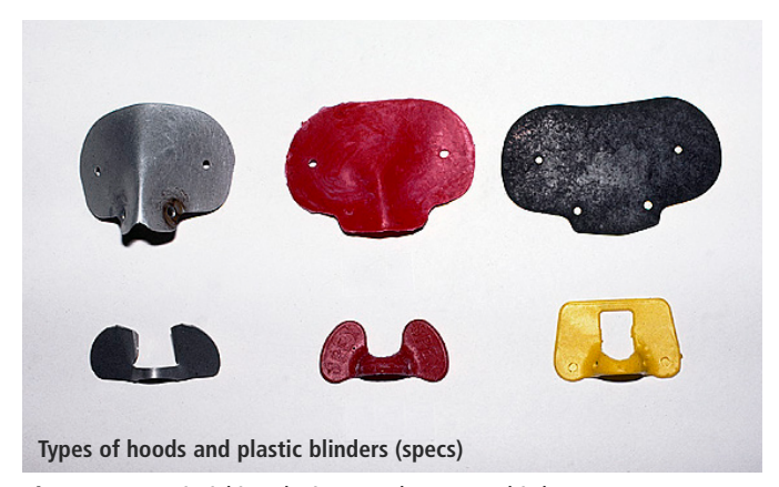
Figure 20. Anti-picking devices used on game birds.