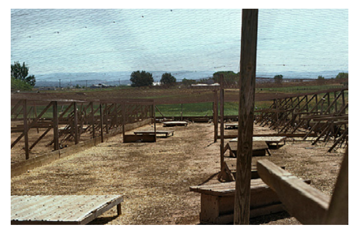
Figure 8. Flight pen showing footer board, nests, and escape shelters.