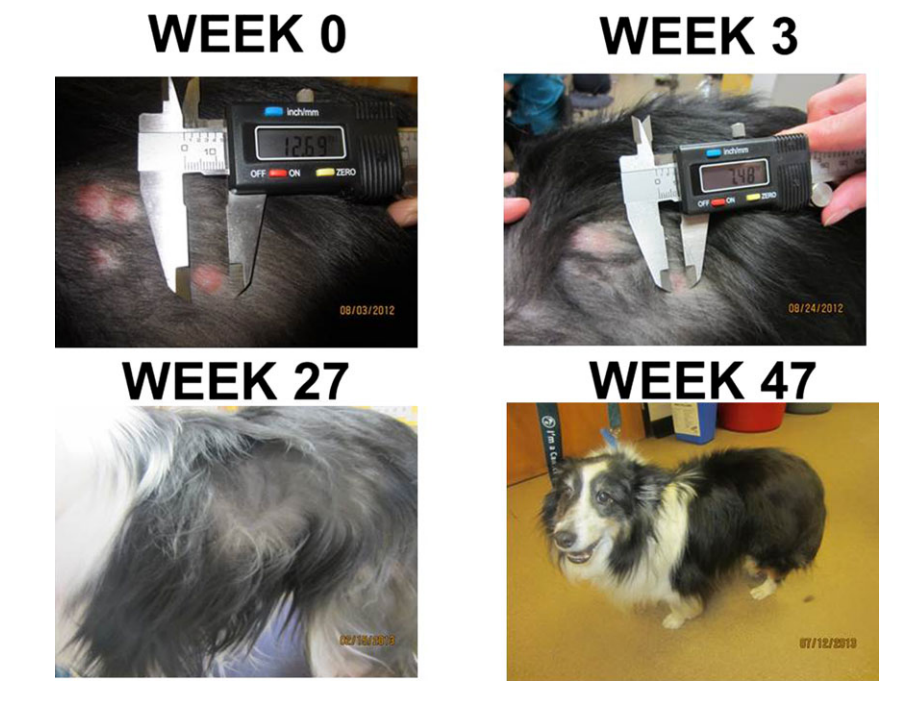
Fig 1. Photographs of the complete responder before treatment, and 3 weeks, 6 months, and 11 months after treatment. Thoracic radiographs continue to be normal.

developed dermatopathy. Biopsies were performed in 2 dogs and supported that the changes were consistent with drug-induced toxicity as opposed to PD. More specifically, histopathology in these 2 dogs disclosed mixed dermatitis and hyperkeratosis, without evidence of neoplasia. One dog was removed from the trial prematurely after the lesions did not resolve after a 21-day dose delay. This patient continued to have SD throughout the dose delay and then was lost to follow-up. Another dog that developed dermatopathic AE received a 20% dose reduction and the dermatopathy improved. This dog developed new target lesions 3 weeks later and was withdrawn. A biopsy was not