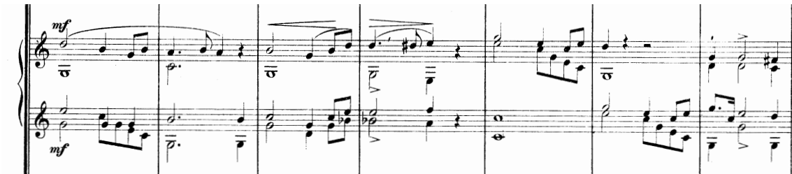
Figure 3.8: The Waldhörner (in C and F) from the Overture of Der Freischütz .

Both of these citations involve the power of the “German” forest, drawing on Der Freischütz to reflect the variegated potentials of the sylvan landscape. The Notturmo , for its part, seems directly inspired in the benevolent sounds of the Waldhörner (forest horns) in Weber’s Overture , a depiction of forest mysticism closely associated with “German” musical tradition by the 1840s, and which serves to transform Oberon’s “Athenian” wood into a decidedly “German”