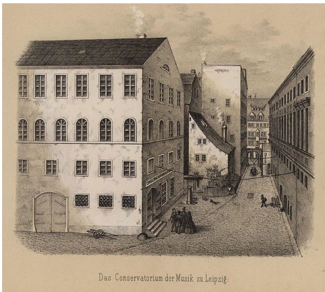
Figure 5.3: The Leipzig Music Conservatory circa 1850. Image held in the digitized Grieg Collection of the Bergen Offentlige Bibliotek.

While curricular goals remained relatively vague in the Pro Memoria , 133 they were outlined in minute detail in the prospectus issued by the Leipzig Conservatory in 1843. Conservatory students, details this document, were to follow a three-year course of study including not only practical vocal/instrumental instruction, but also lectures in harmony, form and composition, conducting and playing from the score, and “theoretical” topics including the history of music in ancient and modern times, the aesthetics of music, and musical acoustics. Admission to the