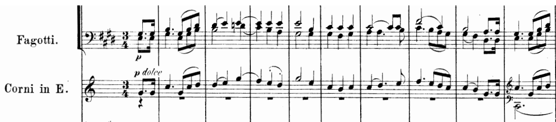
Figure 3.9: Mendelssohn’s Notturmo theme.

one. The Intermezzo , meanwhile, would seem to draw on the negative, supernatural connotations of Weber’s Wolfsschlucht scene, a moment in which Max, the protagonist of Der Freischütz , descends into a forest gulch in order to forge diabolical magic bullets.