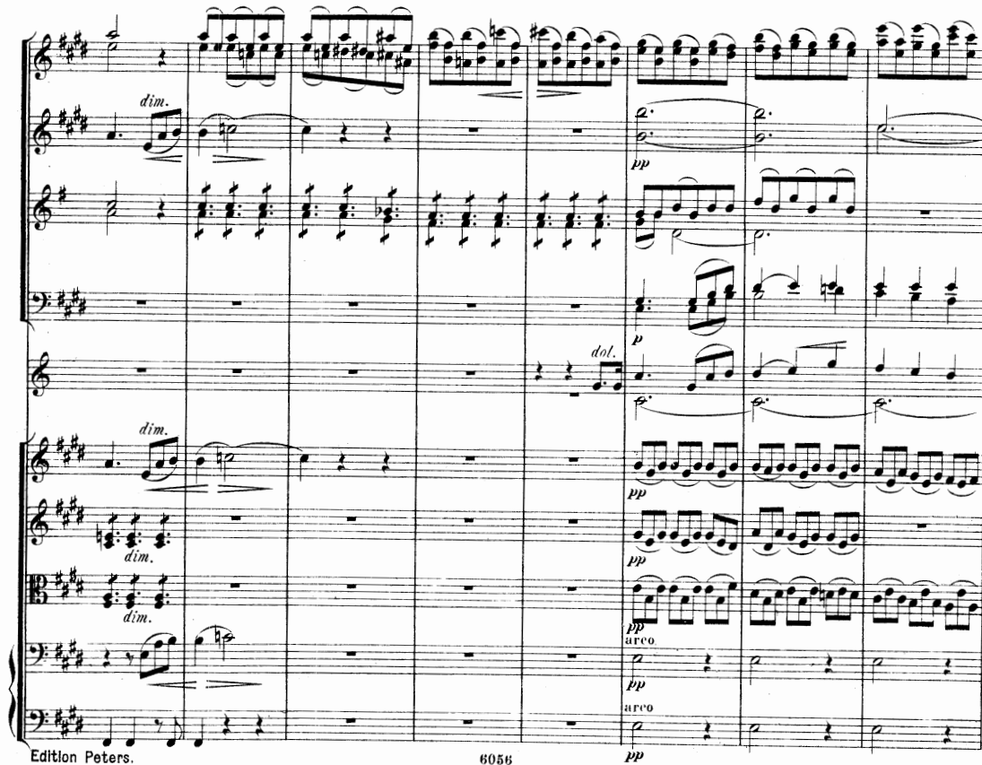
Figure 3.11: Oberon resolves conflict, guiding his subjects forwards in tranquil harmony.

monarchical order. Inaugurated by a regal flourish in the trumpets, this public display of social consonance begins with a triumphant march in C major (episode 1), followed by a statement of