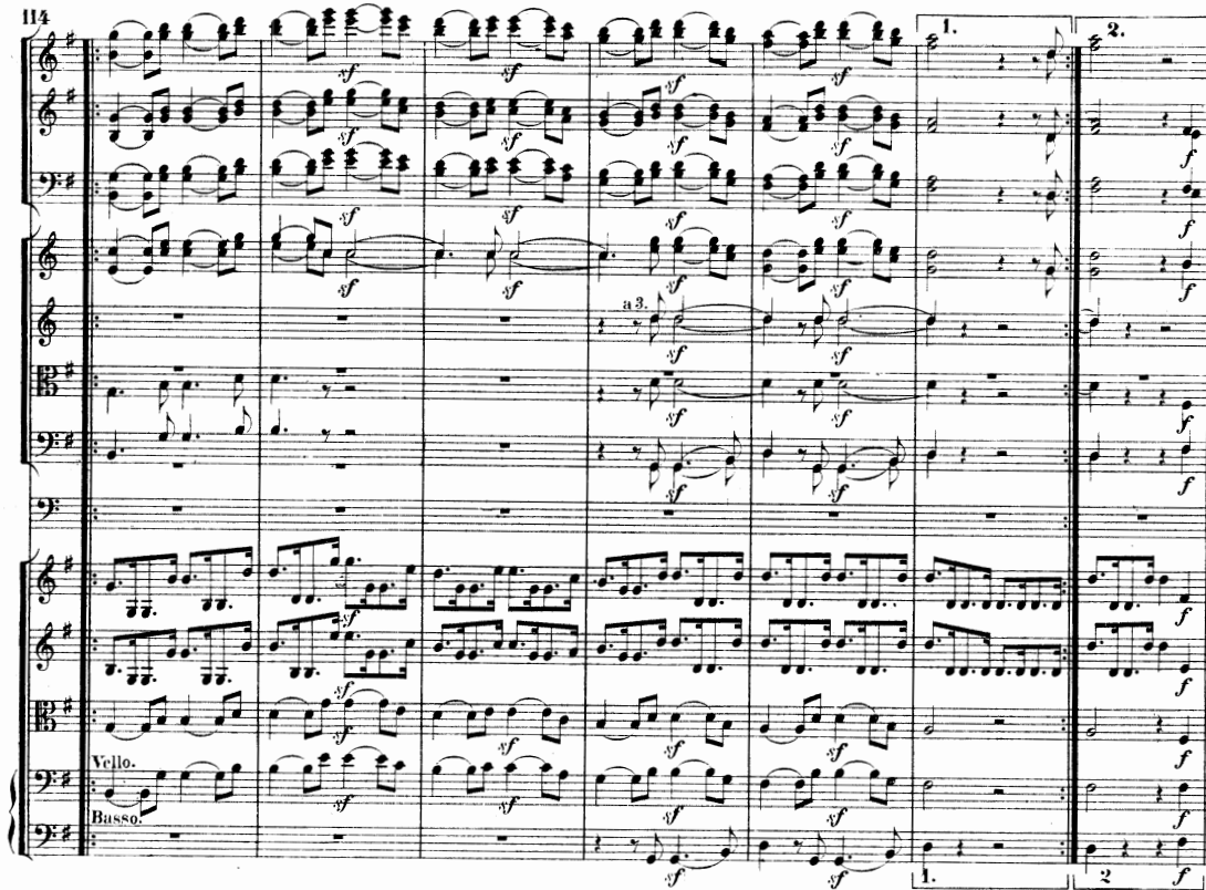
Figure 3.4: Courtly fanfares and galloping horses in the Hochzeitsmarsch .

Mendelssohn's idea: Theseus opens A Midsummer Night's Dream with a discussion of his impending marriage with Hippolyta (although he places it four days in the future, not one), and, after stumbling upon the lovers in the woods, he clearly announces that they will be married with