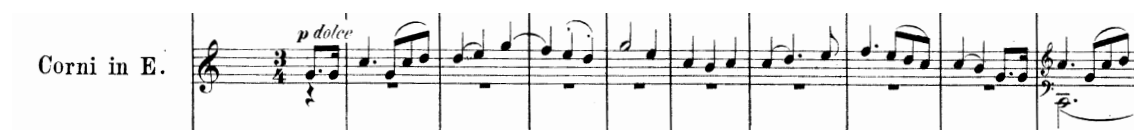
Figure 3.3: The Notturmo horn theme.

The Notturmo : On an abstract level, Mendelssohn's Notturmo represents the turning point of A Midsummer Night's Dream ; the moment in the comedy in which the conflicts set up in Act I, and actualized in Acts II and III, begin to resolve. But, as is indicated by the repetition of the