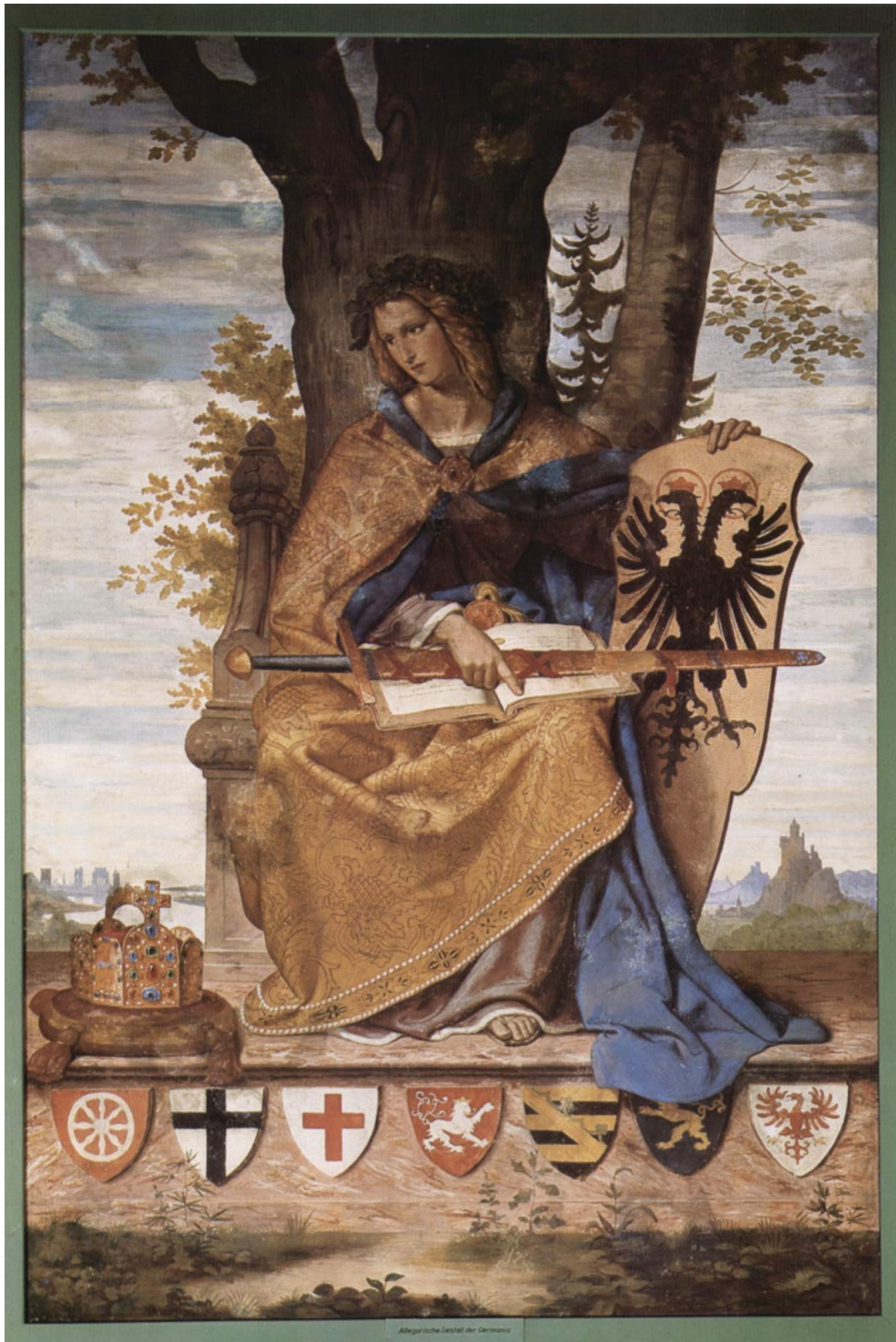
Figure 4.4: Philipp Veit's depiction of Germania in The Introduction of Christianity into Germany by St. Boniface (1836). Image in the public domain.