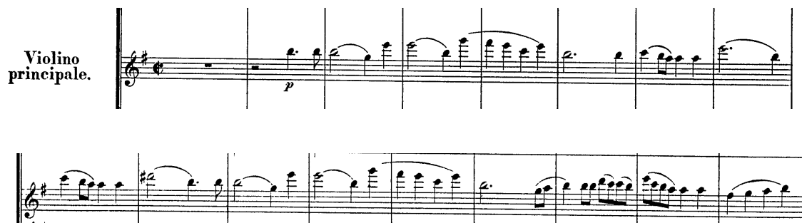
Figure 5.4: The “Jewish” theme of Mendelssohn’s Violin Concerto.

A similar conceptual reversal is worth considering with respect to the sound of Mendelssohn’s Violin Concerto, a piece that constituted the backbone of the repertory for violinists from Ferdinand David onwards. For contemporary ears, anyway, the opening theme of the Allegro of this work exudes a “Jewish” tone; a melancholy nostalgia highlighted by its minor mode lyricism, particularly the sobbing b6-5-4-1, b6-5-4-#7 motif, which calls to mind theatrical scenes from Eastern European Shtetl life: the despair of poverty; the bitter cold of winter wind; perhaps the sung prayer of a Hazzan . 145