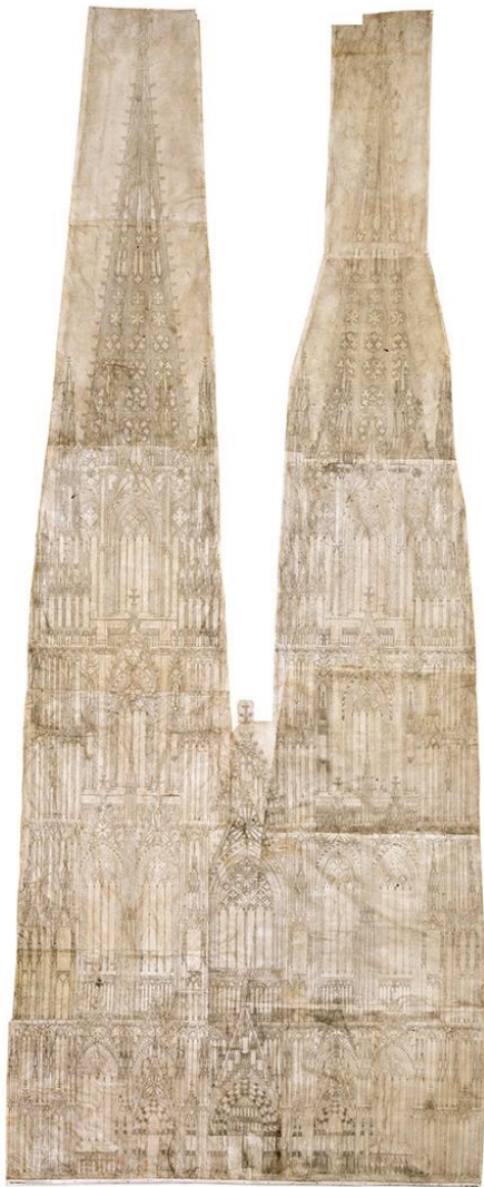
Figure 4.2: Plans for the west facade of the Cologne Cathedral, Meister Arnold c.1280. Image in the public domain.

At root in both Mendelssohn's and Reichensperger's artistic reconstructions, then, was less an impulse to accurately reproduce a historical object, than a desire to emulate a historical