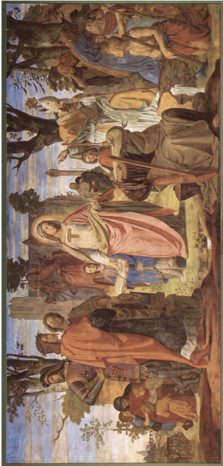
Figure 4.3: The centerpiece of Philipp Veit's The Introduction of Christianity into Germany by St. Boniface (1836). Image in the public domain.