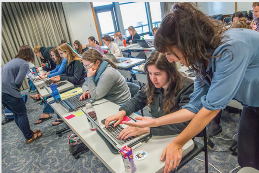
Figure 1. A Software Carpentry Boot Camp for Women at Lawrence Berkeley National Lab.