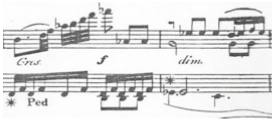
Fig. 22, 2 nd mvt., mm. 37-38.

Dramatic lead in to the last movement with Attacca subito :