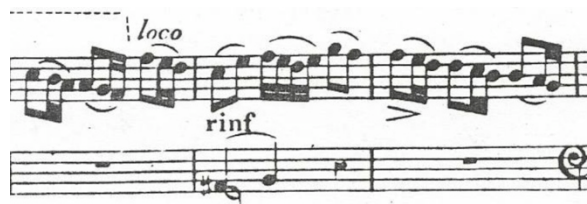
Fig. 3, 3 rd mov., mm. 98-99.