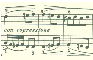
Fig. 35-1, 3 rd mvt., mm. 132-34, Peters.

The addition of crescendo-decrescendo marking in between measures 132 and 133 may, however, be reasonable since the same material after the recapitulation appears with the marking in the first editions.