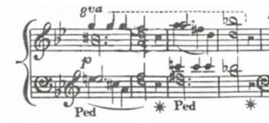
Fig. 16, 1 st mvt., mm. 187-90.