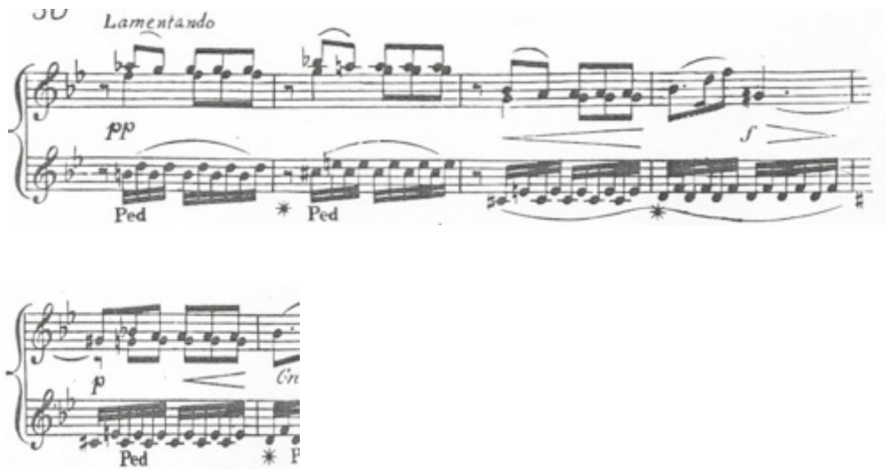
Fig. 18, 2 nd mvt., mm. 32-36.

Special effect, the sound up in the air with unexpected harmony progressions (no resolution):