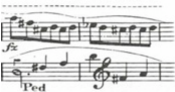
Fig. 13, 1 st mvt., mm. 317-30.

Thirteen measures of pedal on the bridge to the recapitulation: