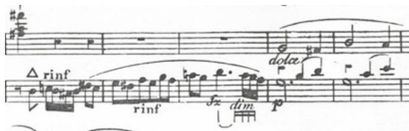
Fig. 10, 1 st mvt., mm. 43-47.

Brendel states, “in general, forzando indicates a more vigorous and sudden attack than does the fp marking, and is written most often to accent already loud passages.” 46 However, two other aspects of the forzando are presented in the Dido sonata that Clementi often marked forzando on passages that he wanted to make expressive, rather than accenting them. For