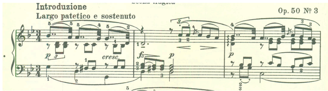
Fig. 27, Clementi, Op. 50, No. 3, mm. 1-3. (Frankfurt, New York: Peters, 1940.)

The small note can be played either on a downbeat or slightly before it.