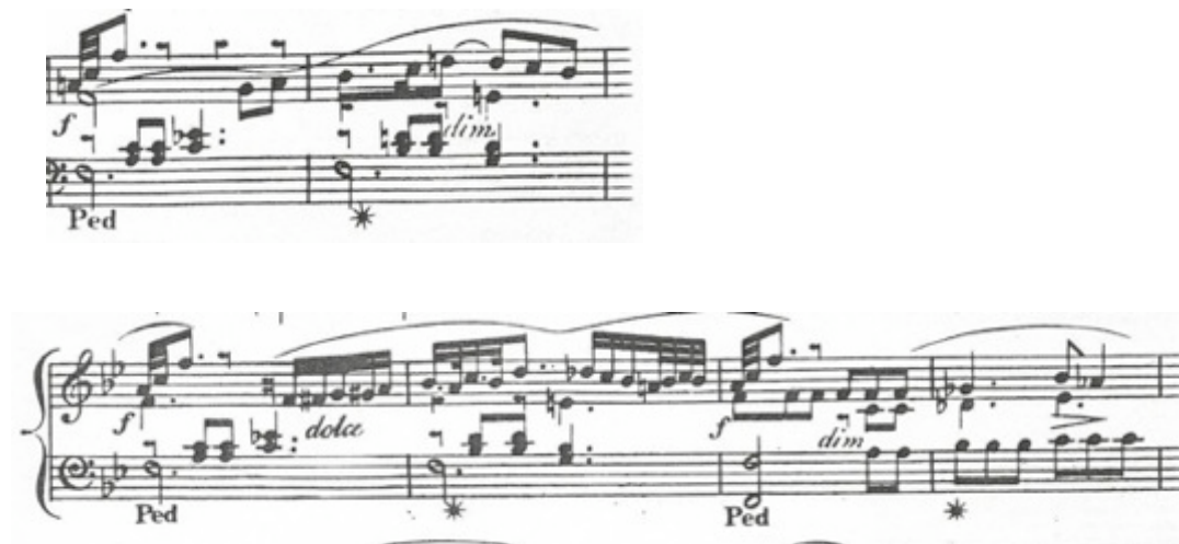
Fig. 4, 2 nd mov., mm. 13-14 and 15-18.

As mentioned earlier, Clementi's piano had keys with much lighter action than modern ones. Clementi wrote his keyboard music for his instrument and could not possibly have anticipated how his music might be interpreted on instruments of the future. For example, this quick-broken chord cannot be performed on the modern piano as quickly as it could have been on the early piano. Rosen cautions, with regard to the action of the modern piano, "the thicker sound and stiffer action of the modern piano also induce slower speeds in the quick movements." 44 Performers should treat these more as blocked chords for an effect, especially when they appear on the downbeat a measure.