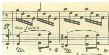
Fig. 36, 3 rd mvt., m. 403 to the end, Peters.

Also, the editor's pedal markings added in Peters edition in the ending section dramatically lead to the stormy and forceful ending (verses the facsimile, p.33).