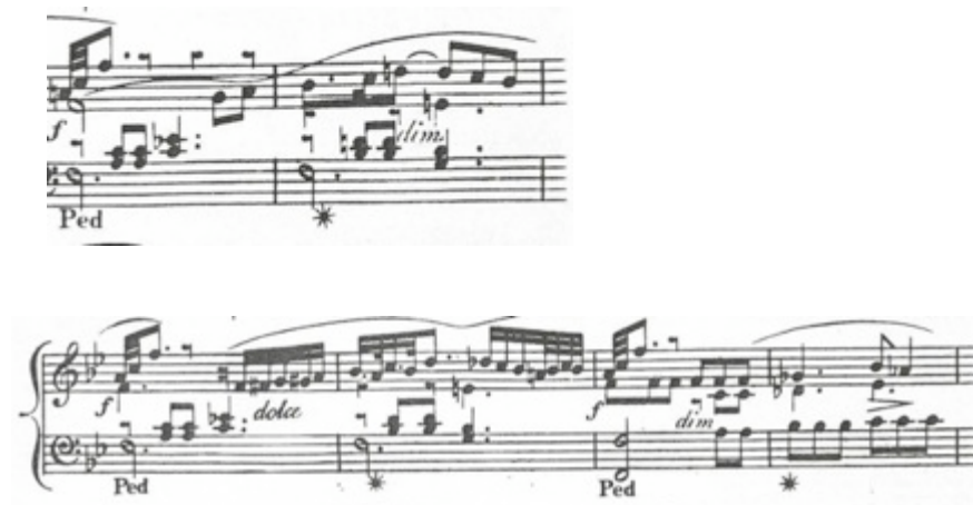
Fig. 17, 2 nd mvt., mm. 13-18.