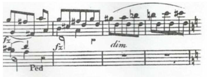
Fig. 21, 1 st mvt., mm. 394-97.

Three measures of pedal with diminuendo (leading G minor to G Major section):