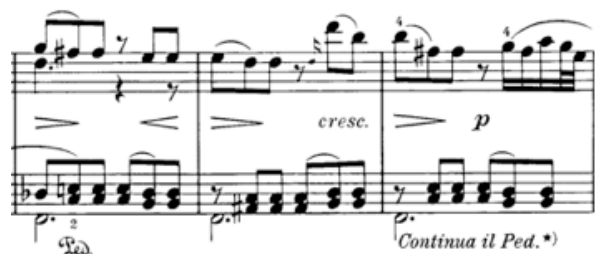
Fig. 30, 2 nd mvt., mm. 55-59, Henle.

As mentioned earlier, it seems that the Henle edition replicates the facsimile edition of the London first edition. There is, however, an exception for pedaling, " Continua il Ped. ," in measures 55-59 of the second movement. Note that the pedaling is based on the French first edition.