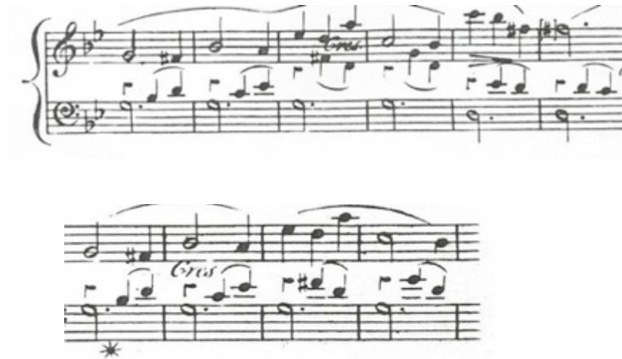
Fig. 6, 1 st mvt., mm. 24-29 and 330-33.

This passage would be naturally sound like a crescendo as the melody ascends to higher pitches. Perhaps Clementi needed to make a point of the crescendo sound on the piano of his time. As modern pianists on modern instruments, we should see the crescendo as a natural crescendo , as the pitch rises, and avoid too much dynamic emphasis on such a simple theme.