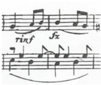
Fig. 33-2, 3 rd mvt. mm. 5-6, Hallberger.