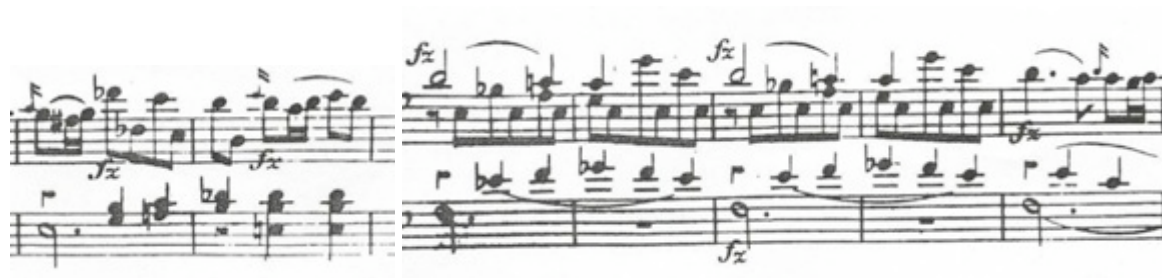
Fig. 12, 1 st mvt., mm. 67-73.

Note that Clementi used more forzando markings for a general meaning to emphasize and accent notes in louder passages as well.