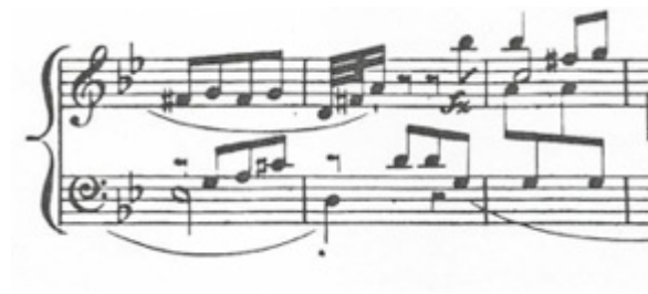
Fig. 5, 3 rd mov., mm. 7-9, 39-42, 135-36, and 152-55.