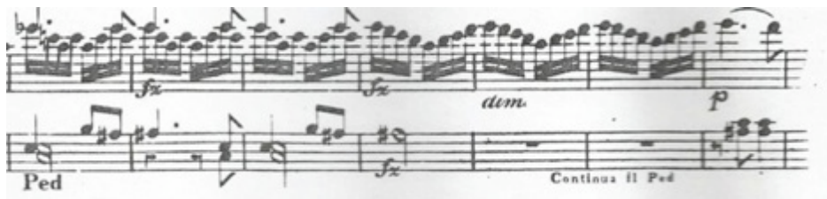
Fig. 15, 3 rd mvt., mm. 265-80.

Fifteen measures of pedal leading to the recapitulation: