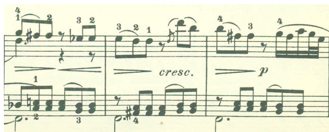
Fig. 31, 2 nd mvt., mm. 55-59, Peters.

In contrast, the edition Peters does not write “ Continua il Ped. ” here, nor even a pedal marking.