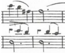
Fig. 25-2, Clementi, Op. 50 No. 3, 1 st mvt., mm. 51-52. (München: G. Henle Verlag, 1978.)

Fig. 25-1, Clementi Piano Sonata in G minor, Didone abbandonata Op. 50 No. 3, 1 st mvt., mm. 51-52. (New York: London Pianoforte School 1766-1860, Garland Publishing, Vol. 4, 1984-.)