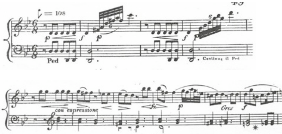
Fig. 14, 2 nd mvt., mm. 1-9.