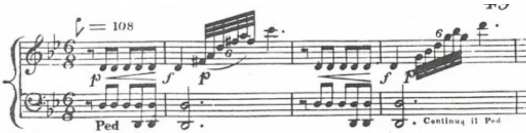
Fig. 8, 2 nd mvt., mm. 1-4.

Clementi's written ornament appears here for a fantasia-like arpeggio with forced long pedaling. Clementi presumably marked the “ p ” marking so that he could add a fantasia character for the beginning of the second movement. However, the first “ p ” marking, which is on D Major chord in measure 2 could be interpreted in opposition to the general meaning of the “ p .” It would deliver a much more dramatic effect if the first arpeggio in D Major chord played with greatly extended sound compared to the following one in G minor chord in measure 4.