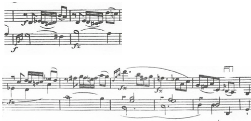
Fig. 11, 1 st mvt., mm. 54-60.

The other aspect of forzando gives more weight on dissonances or unexpected harmony changes.