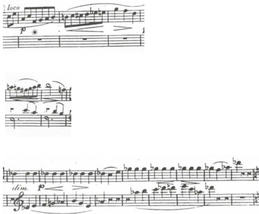
Fig. 7, 1 st mvt., mm. 78-90, 124-25, and 235-43.

too lyrical if performers take it too seriously on the modern piano. Note that this kind of crescendo-diminuendo purposefully presents a natural sound with the pitch's move, a much more Classical approach unlike the tremendous dynamic range of the later Romantic composers.