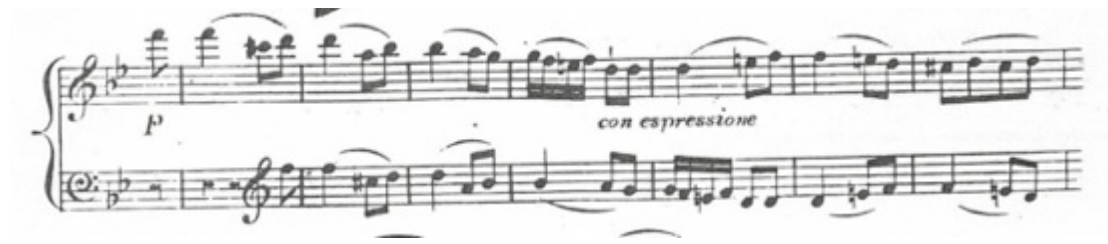
Fig. 9, 3 rd mvt., mm. 128-34.

The most effective and remarkable usages of articulations in the Dido sonata are sf , rf , sfz , and fz , and they appear often. Alfred Brendel stated that rinforzando meant “a cantabile emphasis on one or several notes, usually in a lyrical context.” 45 Clementi often used the rinforzando on a specific note in his Dido sonata, and most of them are intended to set a desperate and stormy atmosphere for Dido’s tragic story. For instance, in between measure 43 and 44 of the first movement, both of two rinforzandos , which are written on a scale in the left hand, makes the atmosphere.