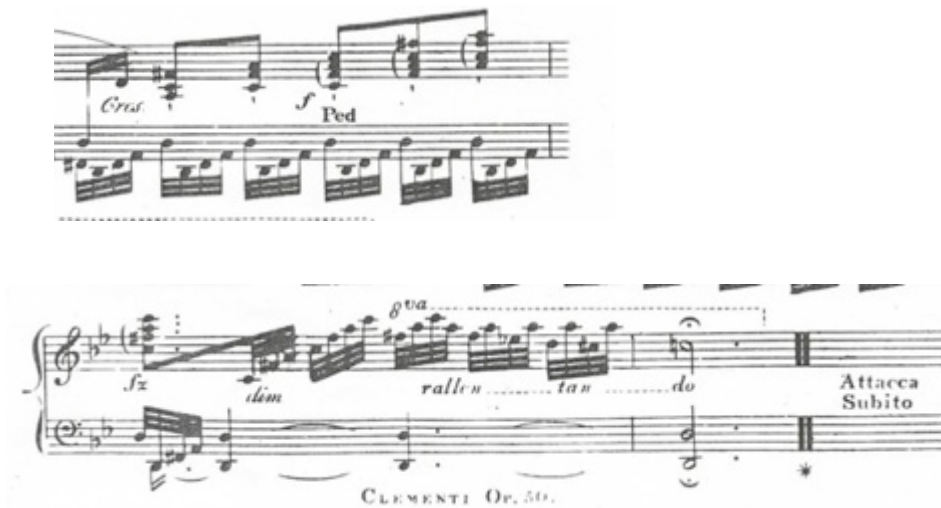
Fig. 23, 2 nd mvt., m. 71 to the end.

Based on these examples, Clementi seems to have wanted a more stormy and forceful sound via pedaling than could be achieved on his piano, and thus he prescribed abundant pedaling to attempt to create his intended sound. The modern concert piano, however, has much richer resonance than the early one, and thus performers have less difficulty achieving this wash of sound than performers in Clementi's time did.