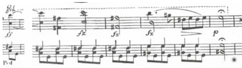
Fig. 19, 3 rd mvt., mm. 201-7.

Special effect, the sound up in the air with tenuto / decrescendo :