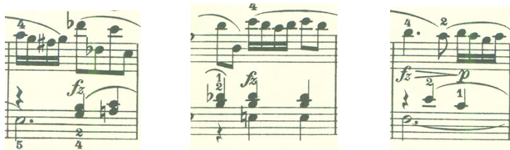
Fig. 28, 1 st mvt., mm. 67, 68, and 73, Peters.

The Peters edition also does not indicate Attaca Subito at the end of the introduction. It shows a deliberated separation between sections, which might cause a performer to interpret the transition differently than might be implied in the facsimile edition, away from Clementi's intention. Furthermore, many markings are added by the editor such as portando , accent , tenuto , staccato , crescendo , diminuendo , forzando , smorzando and so on.