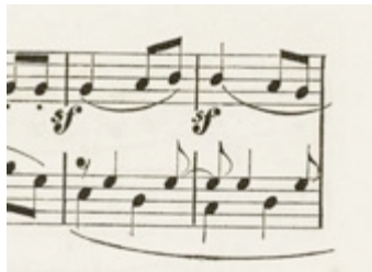
Fig. 34-1, 3 rd mvt., mm. 28-30, Facsimile.