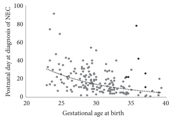
FIGURE 1: Inverse relationship between gestational age at birth and postnatal day at diagnosis of NEC. Each infant represented by a circle. Black circles represent the infants with congenital gastrointestinal anomalies (gastroschisis and Hirschsprung's disease).

3.1. Baseline Data. Out of 6113 admissions to the NICU, 172 patients (2.8%) developed NEC (Table 1). Incidence of NEC decreased with increasing GA. The incidence of NEC in infants between 28 and 33 6 / 7 weeks was 7%. There were more MPT infants with NEC (n=99) compared to the other two GA groups (n=73). There was an inverse relationship noted with postnatal age at presentation of NEC in relation to GA at birth (Figure 1), and most of the infants in our study group presented at an average GA of 29-33 weeks. A large percentage of infants over 35 weeks are not admitted to our NICU; hence, as a percentage of total hospital births >34 weeks, incidence of NEC in near term infants was 0.4% (30 infants with NEC in 7188 total live births >34-week GA in this study time period).