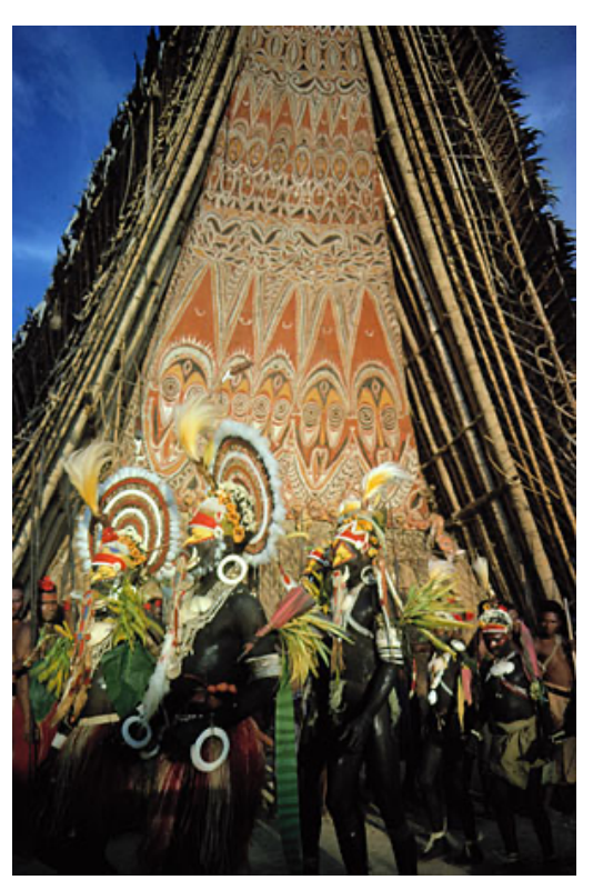
Figure 2. Korambo at Kalabu Nyambak, Eastern Abelam, during the performance of a Nggwal puti initiation, 1962. Dargie visited this village and the korambo is similar to the one he commissioned. Photograph by Robert MacLennan. Courtesy of Robert MacLennan<sup>18</sup>

Painting in natural pigments occurs on all two- and three-dimensional Abelam ritual and ceremonial objects, as well as on the body. MacLennan's photographs show Abelam initiates with dramatically painted faces performing and embodying ancestors (Fig. 2). All of the figures in the interior of the korambo are embellished with human features and the palette of natural colours—yellow, red, black, and white.