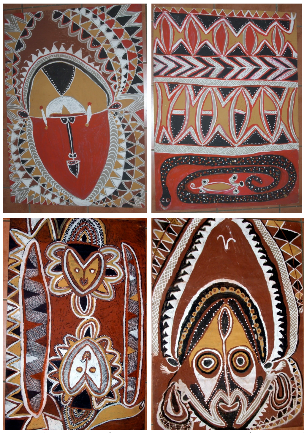
Figure 1. Colour photo prints of paintings in natural pigments on paper from the set Robert MacLennan obtained at Pukago. Images numbered (clockwise from upper left): RM DSCF0913; RM DSCF0916; RM DSCF0845; RM DSCF0841.