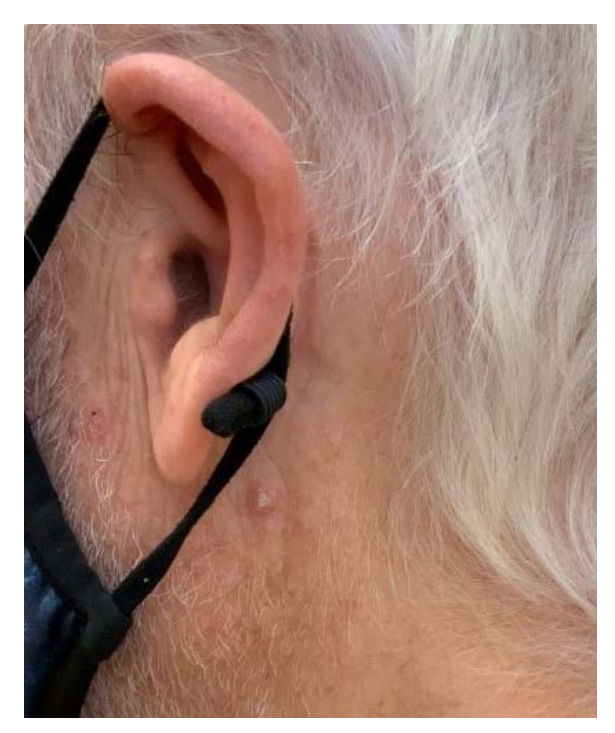
Figure 1 . Squamous cell carcinoma of left post-auricular scalp, site of superficial tangential shave biopsy.

atorvastatin 10mg, fish oil 1200mg, lutein 25mg/zeaxanthin 5mg, and tramadol 50mg. The patient held his fish oil on the day of the biopsy and until two days after.