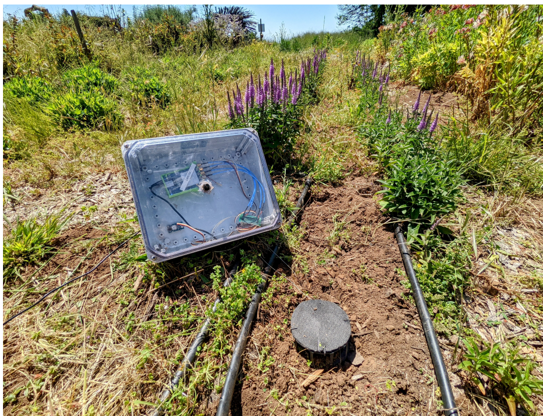
Figure 2: Soil microbial fuel cell staged for deployment at the University of California, Santa Cruz Center for Agroecology.

and 9% discuss direct environmental sensing of factors and processes like pH, soil moisture content, and nutrient cycling. Approximately 9% fall outside these categories, and tend to focus on general improvements to SMFC technology. We noticed a recurring pattern: there are few SMFC publications focused on field deployments. This scarcity hinders the progress of various promising applications for SMFCs. In the remainder this article we discuss some of these applications (energy harvesting, soil remediation, and biosensing), and discuss the limitations of the current literature and suggest a path forward.