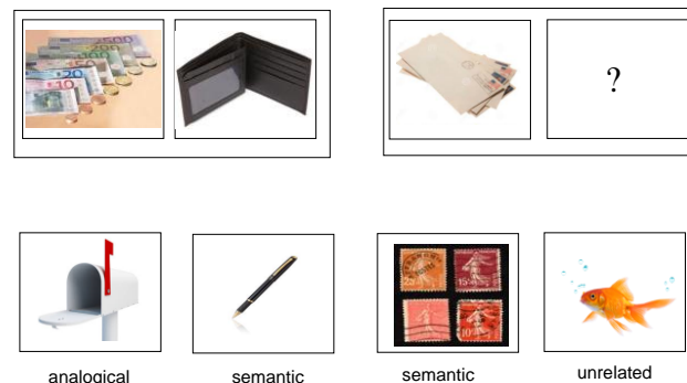
Figure 1: Two examples of analogies used for the “contains” relation, one “weak” and one “strong”. Analogical: Analogical answer; Semantic: Distractor semantically related to the C item; Unrelated: distractor semantically unrelated to C.

At the end of the experiment, children’s understanding of the semantic relation between A and B and between C and Target was assessed. They were shown the A:B pairs and were asked why the two items of each pair went together. The same was true for the C:Target pairs (see Thibaut et al., 2011, for more details).