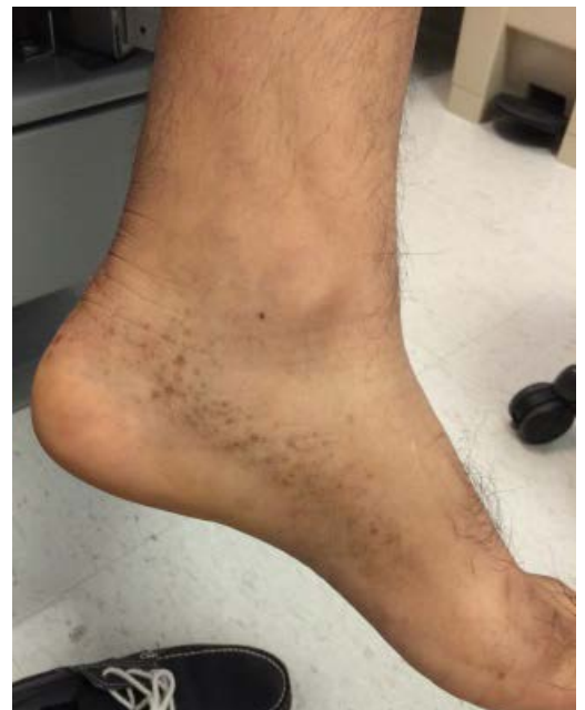
Figure 1. Keratotic papules along sole margin

Histopathology: There is hyperkeratotic compact orthokeratosis. Within the dermis, a Verhoeff-van Gieson stain shows thinning and fragmentation of elastic fibers.