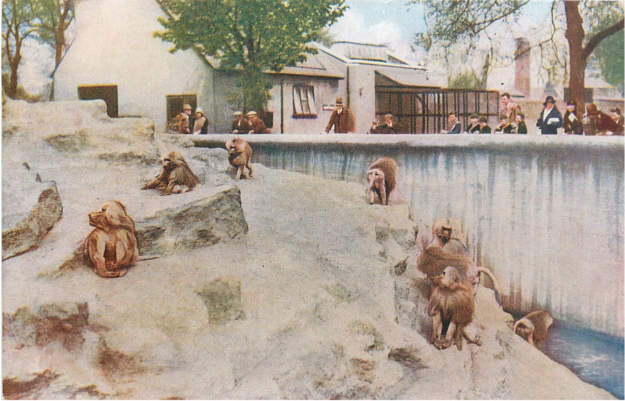
Figure 1: Monkey Hill, London Zoo. Raphael Tucks & Sons, At the Zoo, Series II , 1930. Artwork and photograph in the public domain. Information licensed under CC0. https://www.tuckdbpostcards.org/items/92804-monkey-hill-baboons-shown/

The scene for this momentous event could only have been Monkey Hill, a large display opened at the London Zoo in the 1920s and populated by hamadryas baboons captured in Africa. The zoological display of Monkey Hill was constructed so as to allow a clear and unobstructed view of the baboons, while strictly demarcating the space between the nonhuman animals and the human patrons of the zoo (fig. 1). This architectural division was representative of divisions that emerged in Western Europe and had been historically maintained in both philosophical thought and zoological practices. The dynamics of human-animal dichotomy are present in Bataille's own writings, including those writings inspired by his time at the London Zoo. This paper examines the architectural space of Monkey Hill and shows how Bataille's writings on the baboons reinscribed the human-nonhuman binary of Monkey Hill's architectural divisions, but in a bodily register in which the upper parts of the primate body—the mouth, the face, the pineal gland—came to represent humanity, and the lower parts—the ano-genital or perineal regions—became symbolic of a base and contemptible animality associated with the baboons. In the zoo, divisions between humans and other animals are often part of the display. Zoos manage the line between those seen as worthy of subjecthood and self-determination and those who are not, despite profound morphological and genealogical similarity. I argue that Monkey Hill, and the waterless