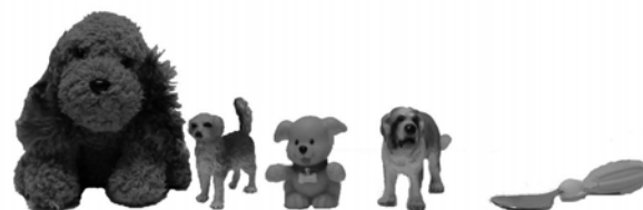
Figure 2: Sample stimuli sets from Experiment 1. In the placement of objects during the experiment, the position of the target was counter-balanced.

To test the hypothesis that phonology partially constrains the correct use of the plural morpheme, we conducted a behavioral experiment eliciting productions from two-year-old children. The experimental task, borrowed from Johnston, Smith, and Box (1997), elicits productions by asking children to describe items to a blind-folded teddy bear. In the present version, the child was presented on each trial with an array of objects as illustrated in Figure 2. Each array included two sets: a set of one (S Set) and a set of more than one (P set).