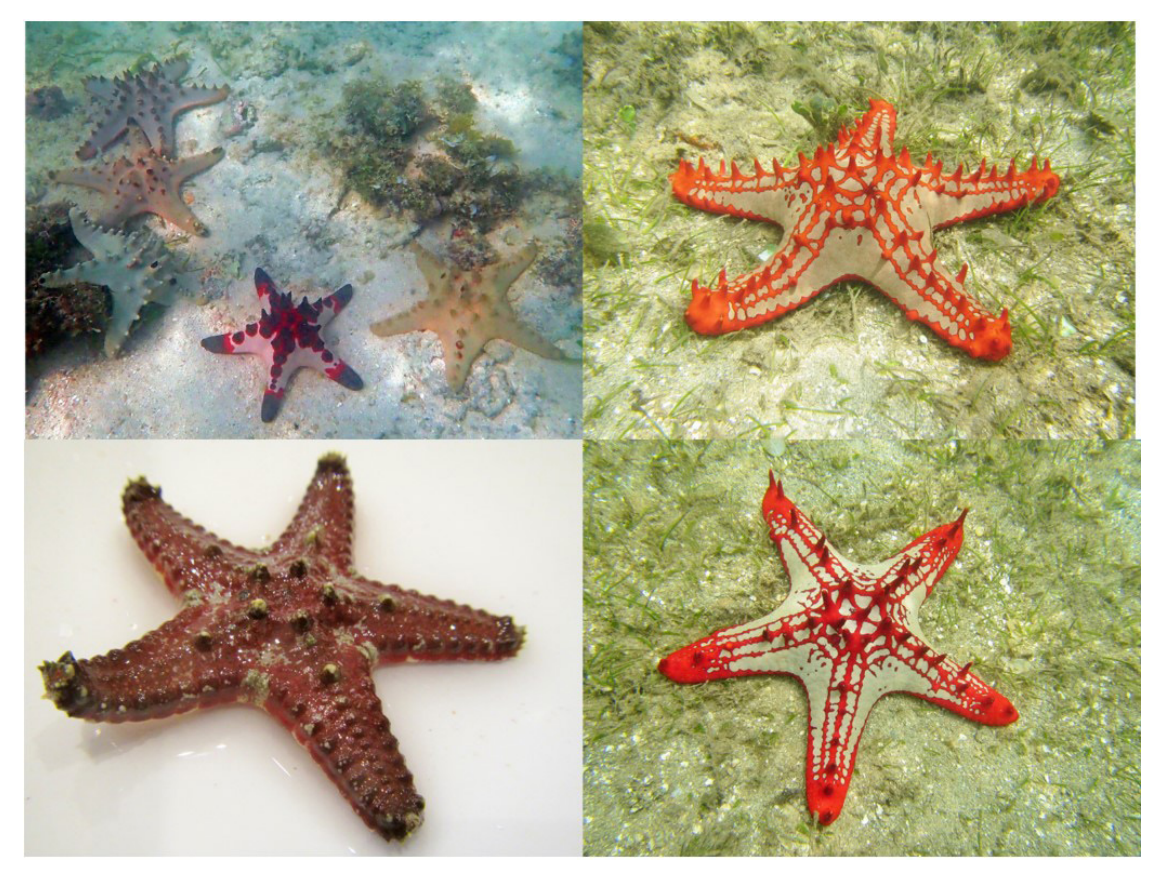
Figure 1. Comparison between Protoreaster nodosus (top left, 5 specimens from Vanuatu displaying color pattern variation, diameters around 25 cm), P. lincki (top right, diameter 20 cm), a juvenile P. lincki (bottom left, diameter 8 cm), and a P. lincki without superomarginal tubercles (bottom right, diameter 25 cm). All specimens were located at Mayotte Island.

colors (be it by drying or conservation in ethanol or formalin), and are hence harder to tell apart. They are mostly distinguished by the presence in P. lincki of lateral tubercles on both side of the arm tips, on the distal superomarginal plates (from 0 to 7 per side). However, these tubercles can be reduced or even absent in some specimens, even at a mature stage (as in Fig. 1). Döderlein (1936) seemed unaware of this variation. P. nodosus generally bears larger and more conical tubercles, which are sometimes restricted to the five primary radial plates, and are usually in only one, carinal, row outside the disc. For both species, the abactinal tubercles shape can range from rounded bumps to elevated spines: they are always bumpy in young specimens and can taper or not with growth. However, P. lincki seems to have more often tapered tubercles. Both species have a similar size and shape: P. lincki is usually described with a ratio of arm length (R) to disc ray (r) of R= 2.3^3 r, and P. nodosus R= 2^3 r (Marsh & Fromont 2020). Juveniles of both species are inconspicuous and nearly indistinguishable, both flattened, dull-colored with only 5 central short, blunt, bumpy tubercles at early stages. They both superficially look rather like P. nodosus (or even some goniasterids, despite extensive papular areas), which may cause confusion. Juvenile oreasterids are known