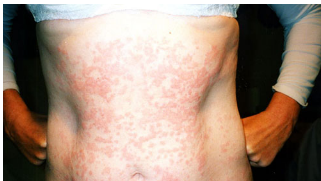
Fig 1 Typical cryopyrin-associated periodic syndrome rash showing figurate erythematous macules and urticated papules

erythema to juicy urticated papules and plaques, and there is commonly a diurnal pattern, with rash severity increasing in the evening [9], although in NOMID patients, the rash may be present persistently. Neurological manifestations can arise from increased inflammation, including headaches, hearing loss, raised intracranial pressure, and meningitis [3]. Sensorineural deafness is progressive and can occur in adolescence or adulthood [10, 11]. Examination reveals cochlear inflammation without any observed amyloidosis in the Corti apparatus or cochlear nerve [12, 13]. In addition, autopsy of MWS patients with deafness revealed atrophy of the cochlear nerve and a lack of the Corti organ, suggesting the inflammation causes irreversible damage, and pointing out the importance of early identification and treatment [11]. Ophthalmologic manifestations include conjunctivitis, uveitis, and papilledema. Rheumatologic manifestations, more specifically in NOMID, include characteristic arthropathy affecting large joints such as the knees, resulting in joint enlargement and functional disability. This arises from abnormal endochondral ossification, which causes the formation of calcified masses in the joints [14]. Lastly, systemic AA amyloidosis can occur in about 25% of CAPS patients, commonly affecting the kidneys [8].