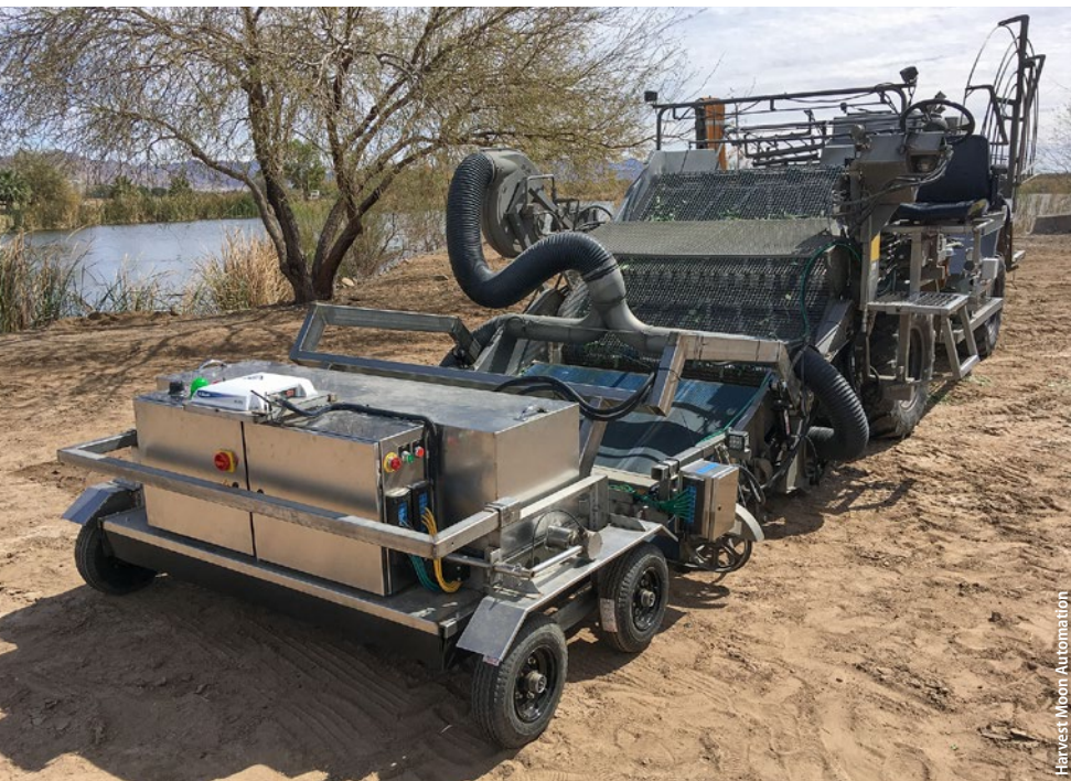
Harvest Moon Automation

This modified leafy greens harvester, developed by Harvest Moon Automation in partnership with two Salinas Valley growers, uses a camera and pattern-recognition technology to spot foreign objects and diseased or damaged plants. A mechanical arm pushes such contaminants out of the way of the harvesting blades, so they are left in the field instead of being fed into the processing line.