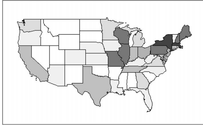
FIG. 1.—Distribution of shoe plants in 1940

entry. With a small deposit, anyone can lease equipment from the United Shoe Machinery Corporation (USMC) for a modest royalty, a little less than 2% of the cost on each pair of shoes produced (Schultz 1951). The lack of strong scale economies and barriers to entry allows small, independent plants to continue playing an important role in the footwear industry.