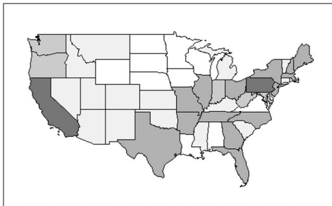
FIG. 2.—Distribution of shoe plants in 1989

than eight plants per million people, four states exhibit much higher concentrations: Maine (32 per million), New Hampshire (19 per million), Missouri (9 per million), and Massachusetts (8.5 per million). Second, these maps do not show the geographic concentration of production within states. Nevertheless, plants tended to cluster in small regions: around Boston in Massachusetts, near St. Louis in Missouri, and close to Milwaukee in Wisconsin. Third, towns typically specialized in the types of footwear they produced. For example, in Massachusetts, Haverhill and Lynn primarily made women's shoes, while the South Shore specialized in men's shoes (Davis 1940). Why do we see such extreme concentration in the location of shoe manufacturing facilities? Moreover, why do we observe such stability in the geographic distribution of production?