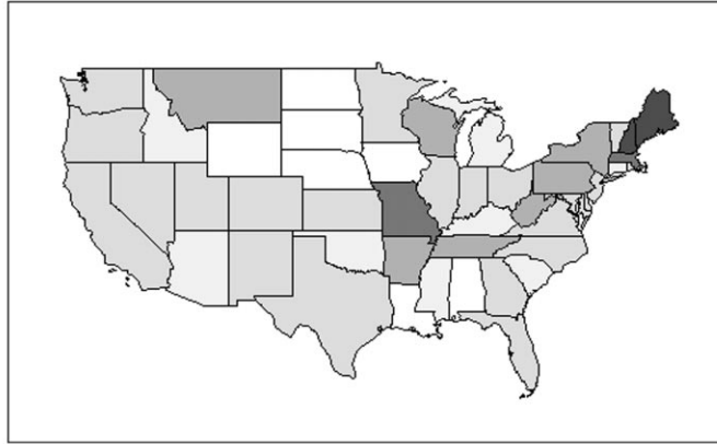
FIG. 3.—Density of shoe plants per capita in 1989

tered around sources of raw materials. For example, steel manufacturers tend to locate near iron ore reserves (Harris 1954).