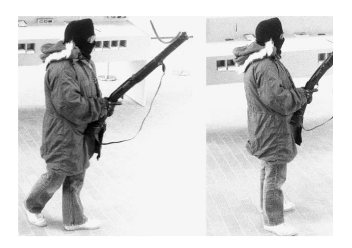
Figure 1: Security images taken during a bank robbery.