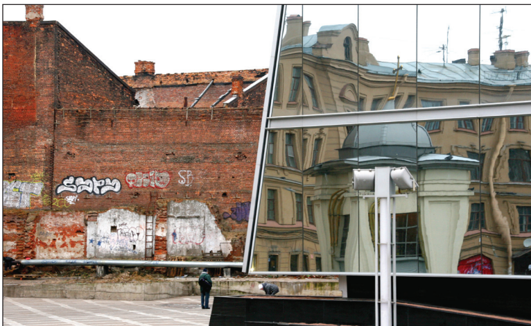
City squares are palimpsests containing and exhibiting numerous historical, social, and cultural layers representing the lives, interests, desires, ambitions, and struggles of city inhabitants.

The question is, though, whether such an ideal public space, open to everyone, exists in reality. Isn't there always the potential for domination by some groups? It seems that nobody believes in the coherent and harmonious public space of rational debate and consensus anymore. Rather, public space today is considered to be a conflict-prone and contested battlefield of and for power.