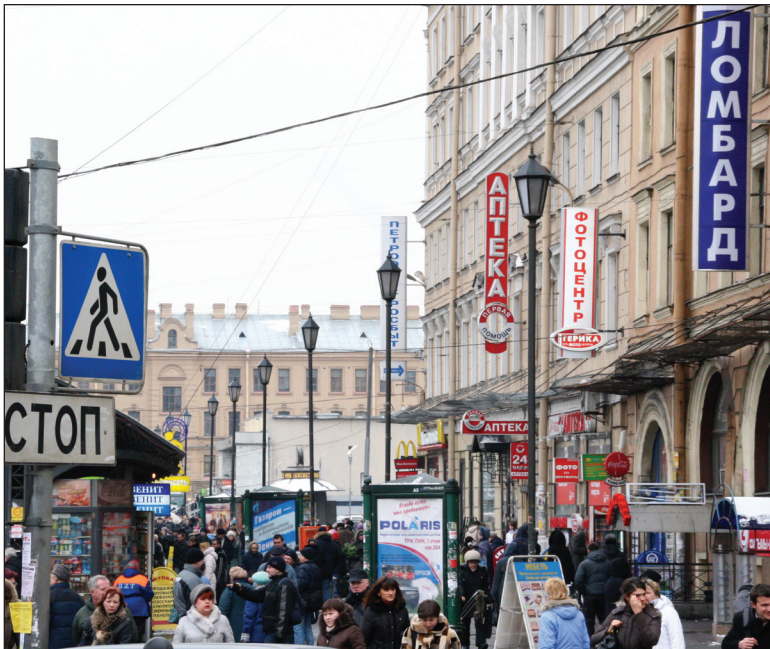
The image of the square has been commercialized by a profusion of small shops and department stores, by shop windows and neon lights, by giant billboards and “sandwich men.”

Furthermore, the visual aesthetics and actual appearance of the squares and other public spaces in contemporary cities have also been politicized by slogans and symbols representing political power, by events like demonstrations and protests, by people, such as the police, as well as by buildings like those of the city or state authorities.