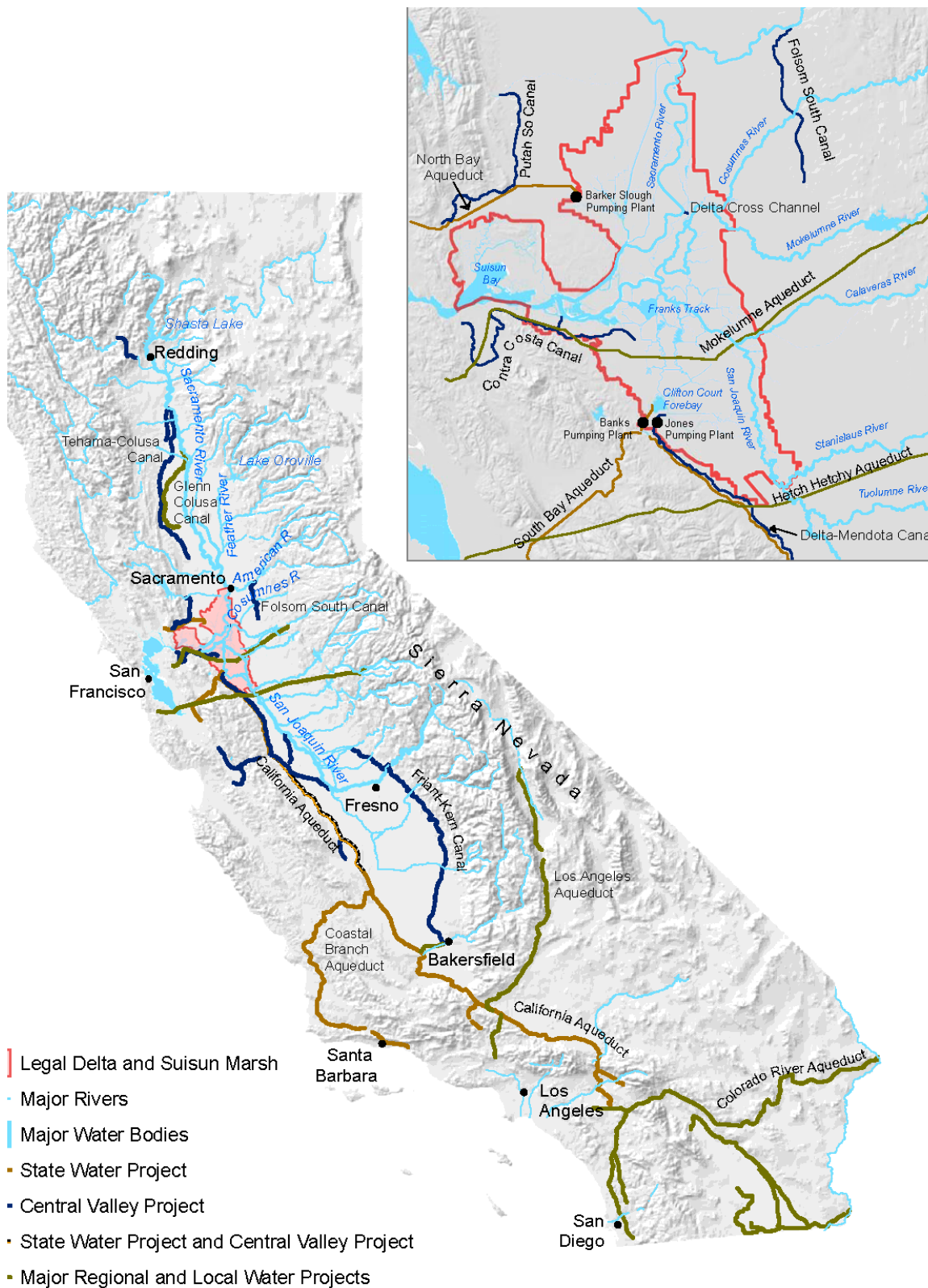
Figure 1 Map of California with Delta inset showing major water redistribution infrastructure and key landmarks