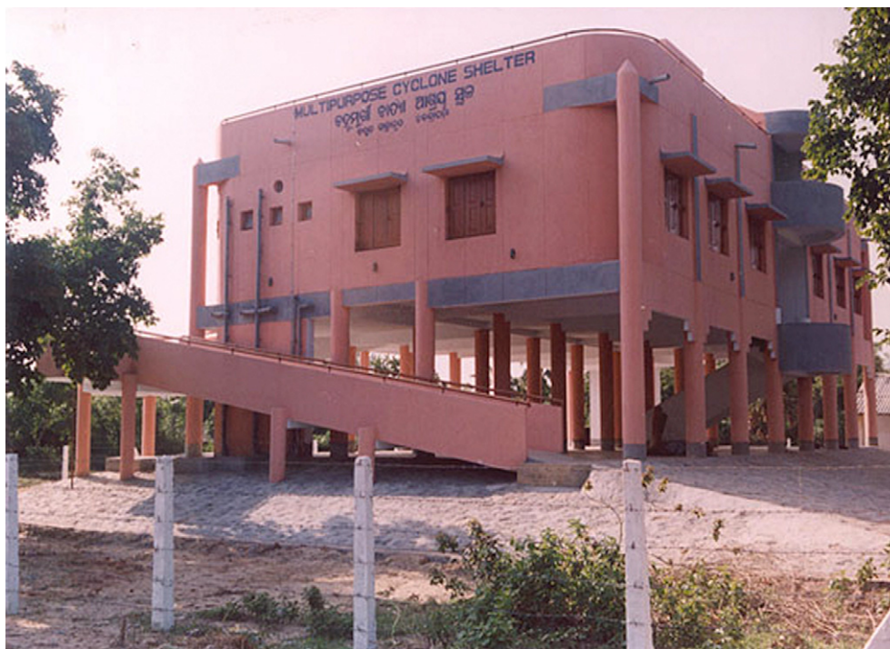
Fig. 3. Cyclone Shelter in Orissa

specifically, is flood preparation by families in Orissa differentially affected by the three features of place attachment, economic, genealogical, and religious?