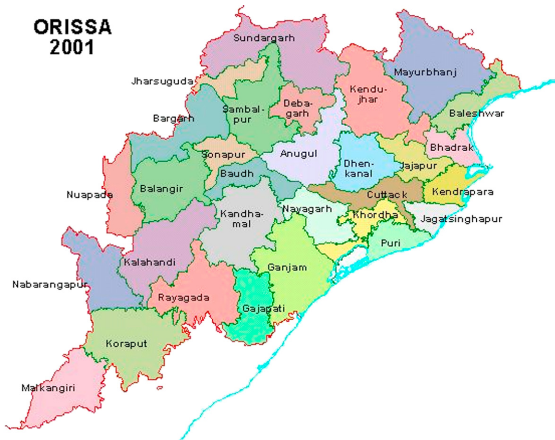
Fig. 1. Orissa Physical Map. Source: http://images.google.co.in/imgres?imgurl=http://www.travelindia-guide.com/maps/east/orissa_map_s.jpg&imgrefurl=http://www.travelindia-guide.com/orissa_details.php&usq=_Eyyj1UcMVzE01jUGHONWA322G4E=&h=434&w=596&sz=109&hl=en&start=28&tbnid=0ztH4j3eSQDhBM:&tbnh=98&tbnw=135&prev=/images%3Fq%3DOrissa%2BMap%26ndsp%3D20%26hl%3Den%26sa%3DN%26start%3D20 dt. 08.12.2009

The impacts of recurrent floods on this densely populated area are severe. People die; livestock perish; human settlements, including houses, are damaged or washed away; paddy and other crops are lost; and roads, bridges and infrastructure are damaged; public and private services are disrupted; the environment and the economy are disturbed. Among the recent floods, those of 1980, 1982, 2001 and 2003 were particularly severe (OSDMA, 2009). The flood of 2001 was the worst (Fig. 2); it affected 18,790 villages, around 9.678 million people, 102 deaths were recorded, nine million hectares of crops (14.83 million USD) were lost, and 250,615 houses were damaged (Architecture & development, 2009). These floods also cause intangible losses: they break down the socio-