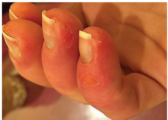
Figure 1. Distal phalanges with discrete, erythematous nodules with a background of poorly-circumscribed, erythematous, and edematous patches