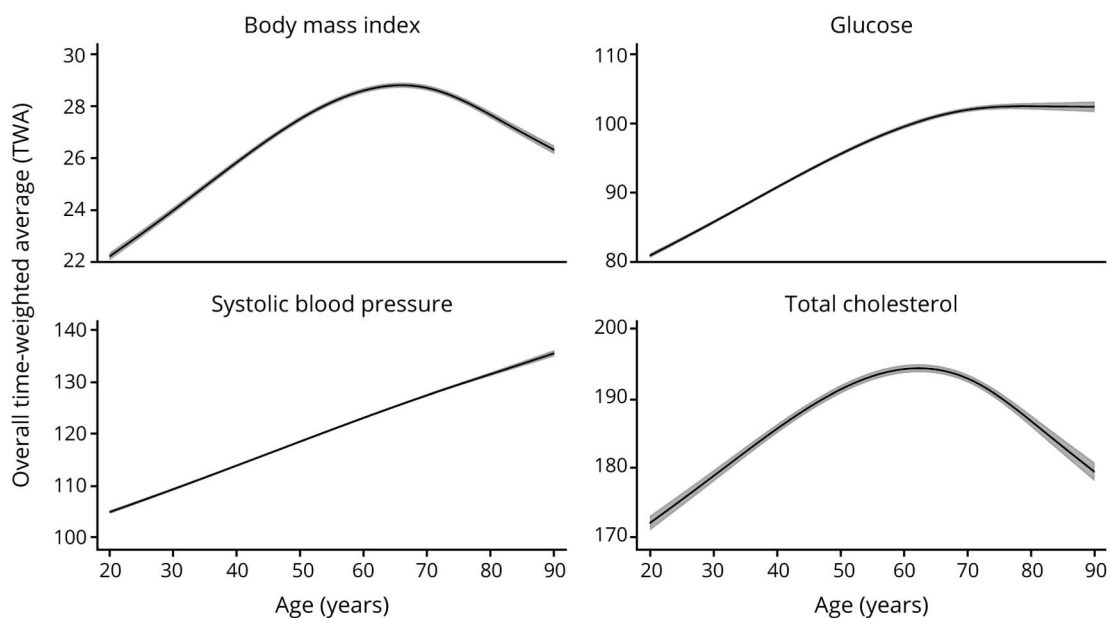
Figure 1 Life Course Modeled Trajectories of Cardiovascular Risk Factors

Trajectories of the overall average with 95% confidence intervals in gray shaded areas.