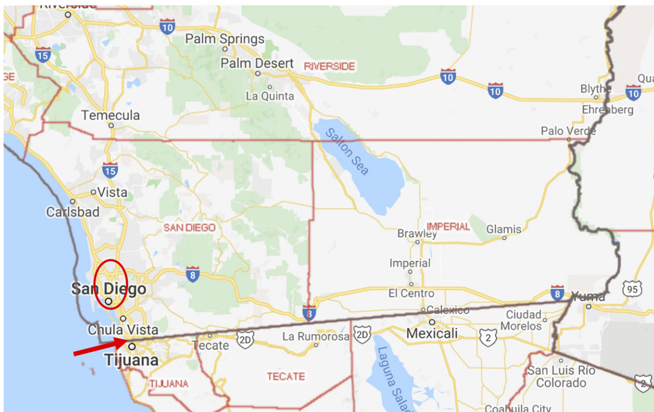
Figure 1. Southern California and Baja California, Mexico. San Diego and Imperial counties located in Southern California, bordering the state of Baja California, Mexico. The city of San Diego borders Tijuana, Mexico while the city of El Centro, California borders Mexicali, Mexico. Arrow, San Ysidro Land Port of Entry. Circle, the location of the 4 ECMO centers (3 adult, 1 pediatric) in San Diego County. Map created by Google Maps, Alphabet Inc, Mountain View, California.

reviewed the data daily and met on a regular basis to discuss management of regional health-care capacity, including an assessment of current status and an evaluation of potential emerging shortages. If an increasing trend of San Diego ECMO resource use were to be detected, then steps would be taken to assist the centers to build capacity. This would include requesting additional staffing resources or equipment from surrounding counties or the California Department of Public Health.