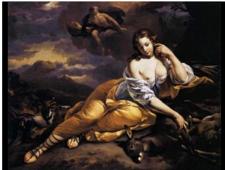
Nicolaes Berchem, Jupiter Notices Calisto , 1656, Oil on canvas, Private collection

The libidinous character of Elena (Helen of Troy) was represented on my final concert by a rich and sexually explicit duet between soprano and countertenor. Because Cavalli originally composed the role of Menelao for a high castrato voice, the vocal line lay a little high for my countertenor colleague, so we switched vocal lines for this performance – a change which I believe may have contributed to the idea of gender instability. It is the sexual ambiguity inherent in the castrato voice that makes this duet so suggestively seductive, and we played this advantage in our performance of “Mia speranza.” The similarity of our vocal timbres signified eroticism in a way that perhaps a duet between a soprano and a tenor could not have. The countertenor and I