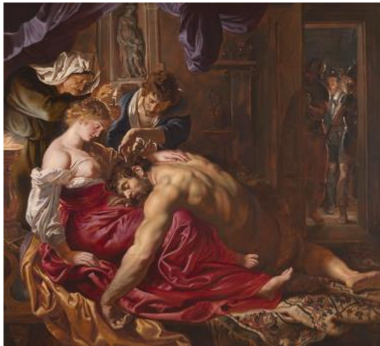
Peter Paul Rubens, Samson and Delilah , c. 1609-10, oil on wood, The National Gallery, London, UK

Delilah's body in the painting speaks of her power over Samson. Her left hand rests soothingly on his naked back, and her breasts are bared as if he has fallen asleep during the act of lovemaking. She regards the sleeping man draped over her lap affectionately, but with the satisfaction of having achieved her purpose. This visual representation of Delilah mirrors the qualities of the female warrior/queen in her cunning, her agency, and her ability to manipulate.