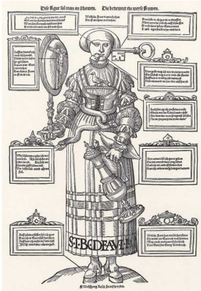
The Wise Woman (c. 1525). Anton Woensam

Look at this figure, which signifies a wise woman; any woman who does as she instructs protects her honor well.