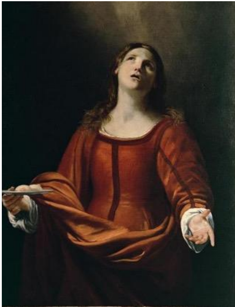
Guido Cagnacci's St. Agatha, c. 1635-1640, (oil on canvas), Modena, Banca Popolare dell'Emilia Romagna, Italy