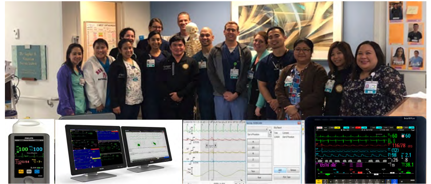
We are excited for the PCU Go Live this spring 2019!