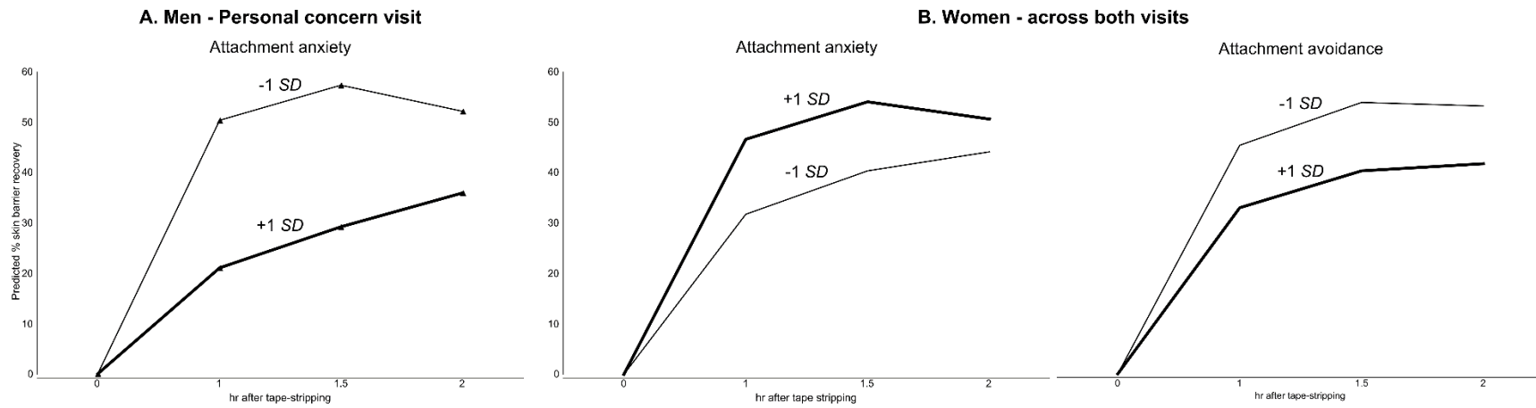
Figure 3. Predicted skin barrier recovery by attachment security for A) Men during the visit involving a discussion of personal concerns, and B) Women averaged across both visits. Redrawn from Robles et al. (2012).