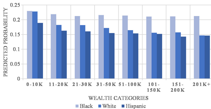
Figure 3 Predicted probability of reporting any discrimination in health care by wealth category and race/ethnicity.

continuous interactions with the health care system. Previous studies have tended to examine discrimination in localized settings using select patient samples. 23, 37–39 A prior study utilizing data from HRS examined discrimination in the health care setting in 2008 only. 40 Our finding that reports of discrimination are common, especially for Blacks, is consistent with prior literature. 22–24 These results, along with previous findings, highlight the pervasiveness of patient-reported discrimination in the health care setting. Patients with chronic conditions rather than acute medical issues require more routine follow-up care, potentially exacerbating health effects associated with patient-provider interactions, where providers may refer to the health care provider or interactions that occur within the health care setting more generally. The focus on patients with major chronic conditions—conditions for which there are effective and appropriate medical management strategies—makes the prevalence of discrimination in health care particularly meaningful.