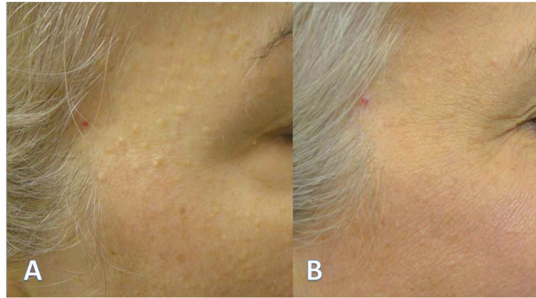
Figure 1. a) Steatocystoma of the face prior to treatment b) Cosmetically satisfactory results at 3-year follow-up after 2 treatments with Fraxel re:pair® CO 2 ablative fractionated laser.