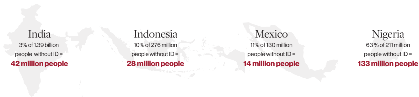
Graphic 3: Populations Without Identification

Many states are currently developing digital identity frameworks. But as new forms of digital identity emerge, it is important to consider issues of consent and control of data (Cheesman, 2022b). How might a public interest identity intervention aligned with CBDC expand financial inclusion and better reorganize people's capacity to act in their own interest? What kind of technical and policy regimes would be necessary to make this possible?