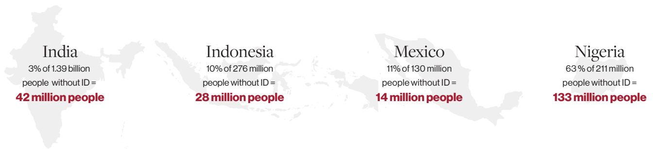
Graphic 3: Populations Without Identification

Many states are currently developing digital identity frameworks. But as new forms of digital identity emerge, it is important to consider issues of consent and control of data (Cheesman, 2022b). How might a public interest identity intervention aligned with CBDC expand financial inclusion and better reorganize people's capacity to act in their own interest? What kind of technical and policy regimes would be necessary to make this possible?