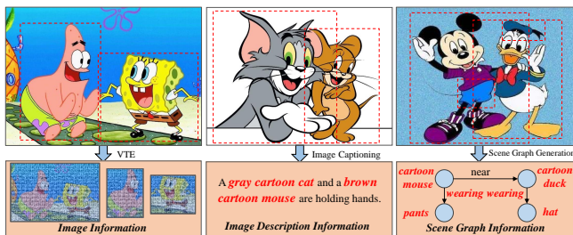
Figure 3: Qualitative analysis of multi-modal knowledge.

notes scene graph information. These experimental results demonstrate the effectiveness of each modality’s data. Furthermore, the combined utilization of all modalities yields optimal accuracy performance, as it leverages the fine-grained visual information of the image, such as the spatial relationship between objects, and colors and sizes of objects, as well as the information of the whole image. For specific examples corresponding to Figure 1, qualitative experimental results are depicted in Figure 3. Image information provided global context and detailed size information about characters like Patrick and SpongeBob. Image description information offered fine-grained details like the skin colors of Tom and Jerry. Scene graph information included intricate relational details, such as the connections between Mickey Mouse and Donald Duck with specific items like pants and hats.