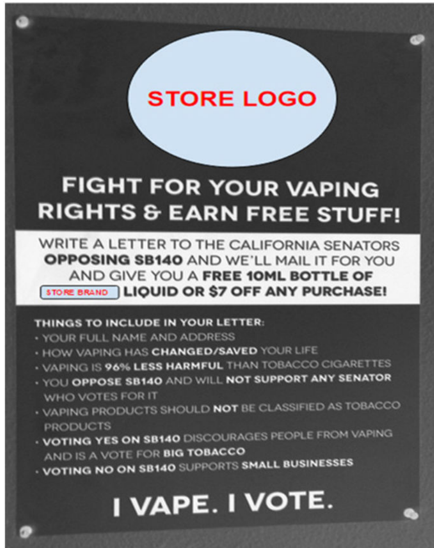
Figure 3. De-identified interior poster offering free e-juice or discount in exchange for customer advocacy actions.