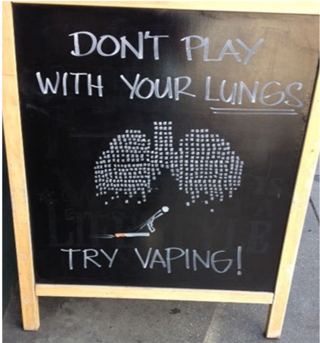
Figure 2. Example of exterior sign indicating vaping is healthier than smoking.