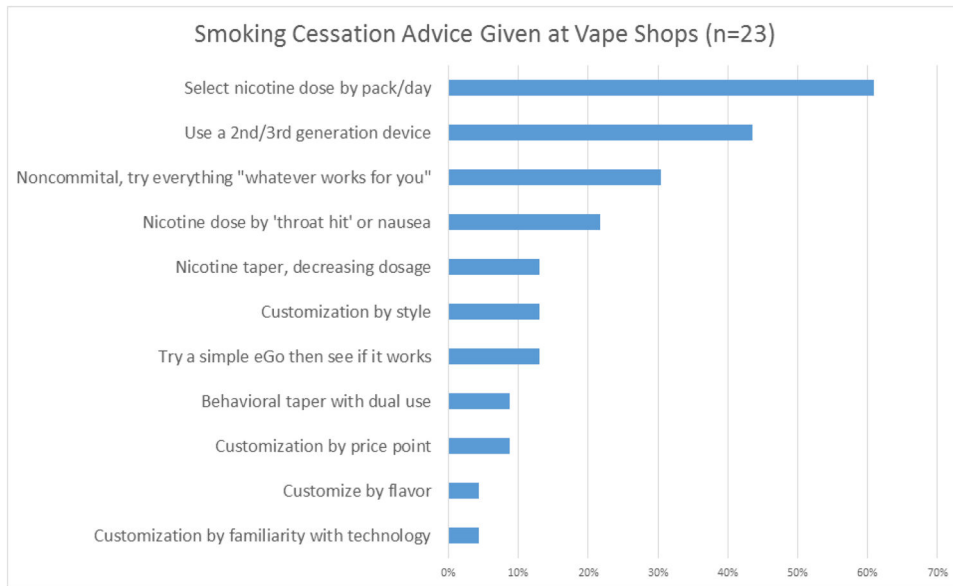
Figure 4. Frequency of types of smoking cessation advice given to customers, as reported by employees of San Francisco/Bay Area vape shops.