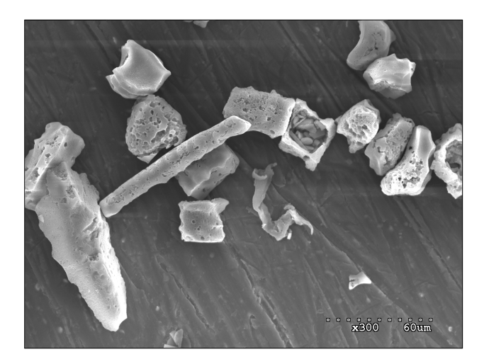
Fig. 3. Phytolith concentrate extracted at CEREGE from the Mascareignite level (10–20 cm) of volcanoclastic soils from La Reunion, France (Crespin et al., 2008). The SEM image is used here to show typical rough phytolith surfaces.